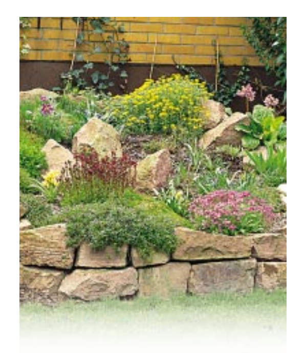
Rockeries, log piles, and debris are attractive to reptiles, which seek refuge in crevices.