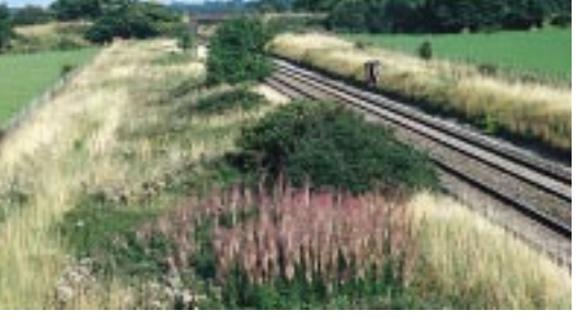
Reptiles often thrive on railway embankments, so if you live close by (even in urban areas) you are likely to have snakes or lizards visit your garden.