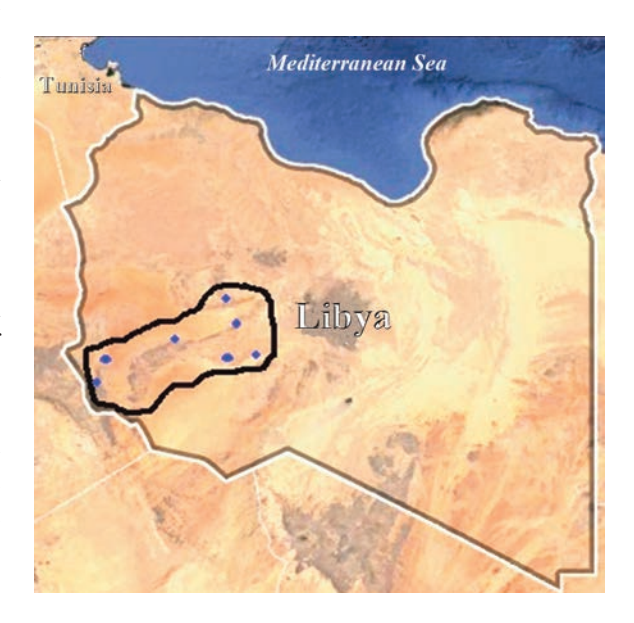
Figure 1. Map of Libya showing the study area.

Field visits were conducted in summer 2006 by the authors of the present paper. Observations, collection of samples and bird watching started from dawn to dusk. Opticron binoculars (with magnification 10x50) and Optolyth spotting-scope were used for accounting of birds, as well as for some wild mammals. Field guides (Heinzel et al., 1998;