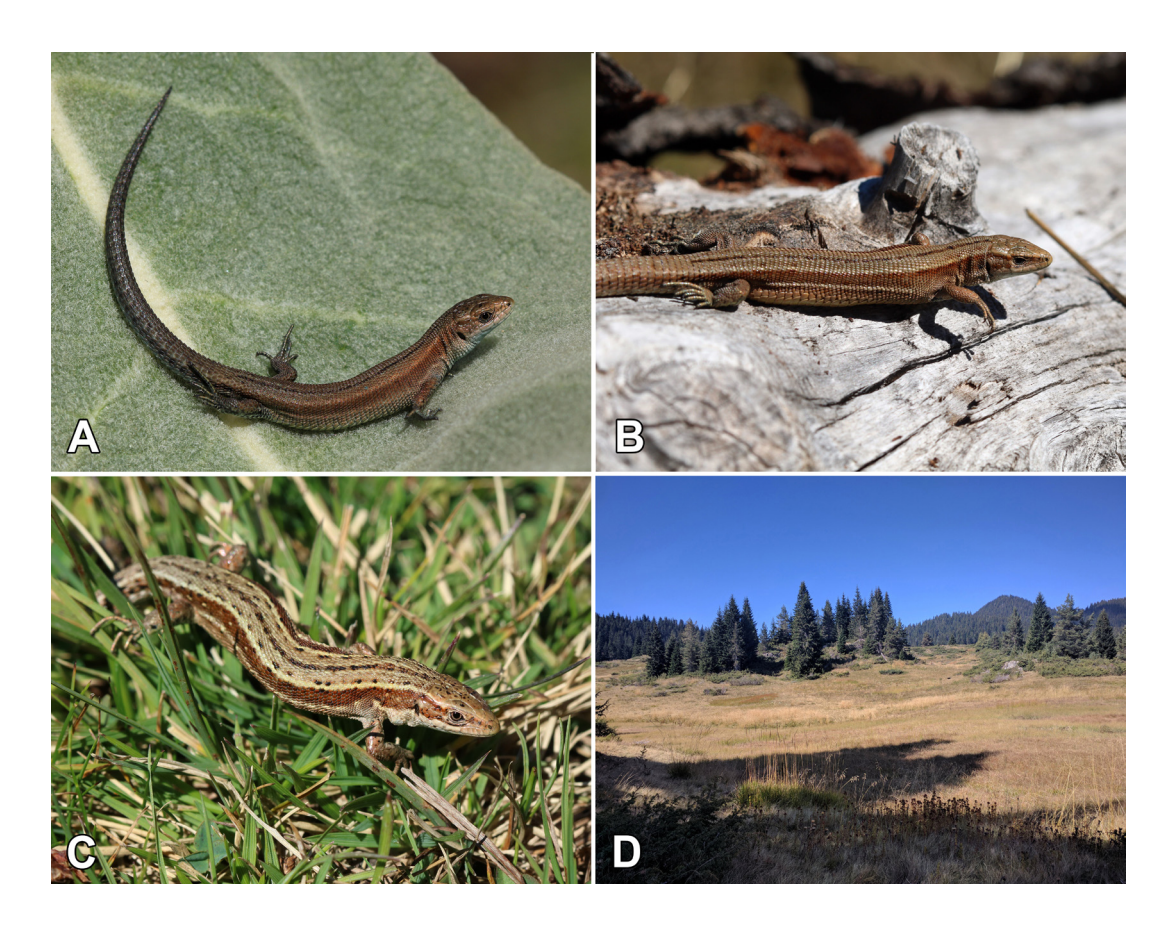
Figure 2. A juvenile (A), an adult female (B), and an adult male individual (C) of Zootoca vivipara from the Greek population and a habitat image of the grassland plateau (D) where the population was discovered (October 2018; location: 41.5641° N, 24.5280° E).