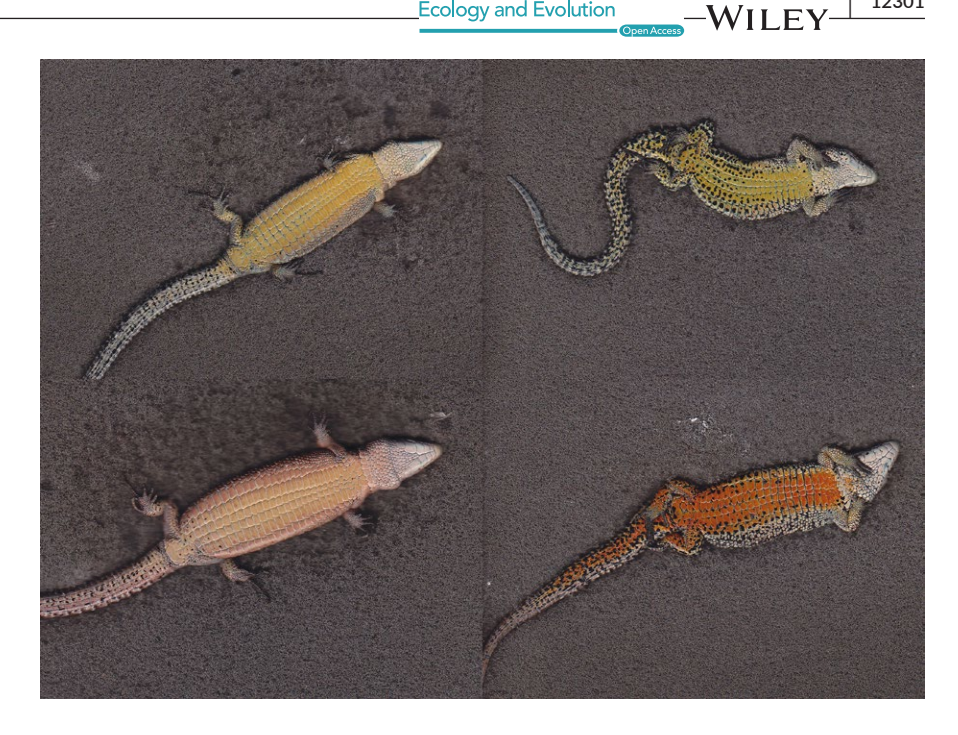
FIGURE 1 Digital photographs of the body color of individual common lizards. The individuals are an immature female (top left), an adult female (bottom left). an immature male (top right), and an adult male (bottom right)