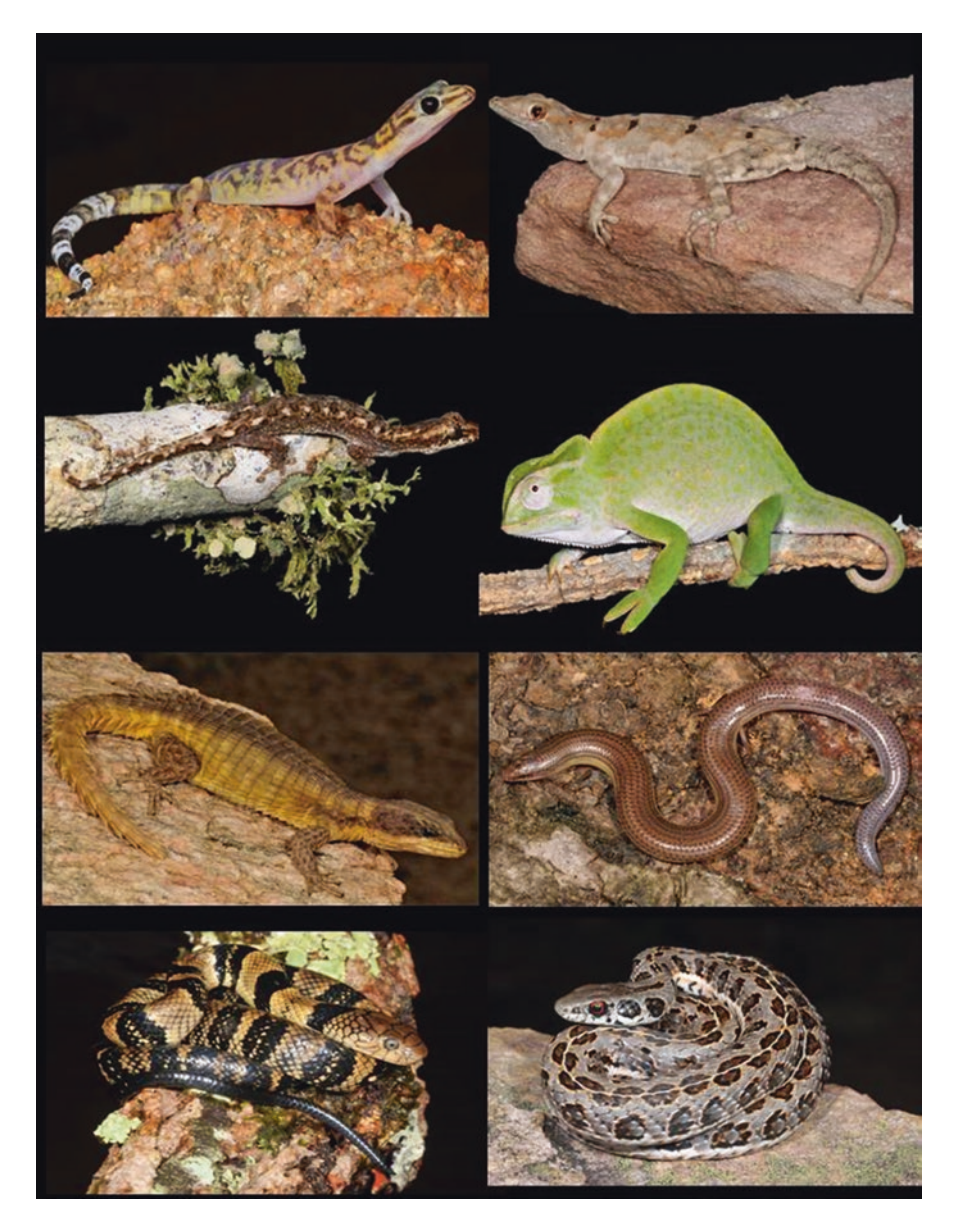
Fig. 13.2 Angolan reptiles. Top to bottom, left to right. Bogert's Flat Gecko (Afroedura cf. bogerti), Omahua Lodge, Namibe; Angolan Namib Day Gecko (Rhoptropus taeniostictus), Chapéu Armado, Namibe; Ansorge's Leaf-toed Gecko (Afrogecko ansorgii), Meve, Benguela; Anchieta's Chameleon (Chamaeleo anchietae), Humpata, Huíla; Kaokoveld Girdled Lizard (Cordylus namakuiyus), Rio Makonga, Namibe; Bayon's Legless Skink (Sepsina bayoni), Quiçama National Park, Luanda; Water Cobra (Naja annulata), Lagoa Carumbo, Lunde Norte; Angolan Skaapstekker (Psammophylax ocellatus), Humpata, Huíla