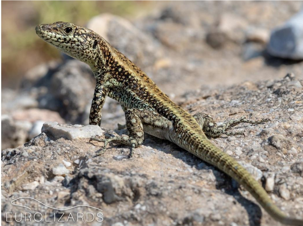
Subsp. oertzeni, male: GR / Ikaria, 11.06.2019 - Males show dark spots on the lower labials.