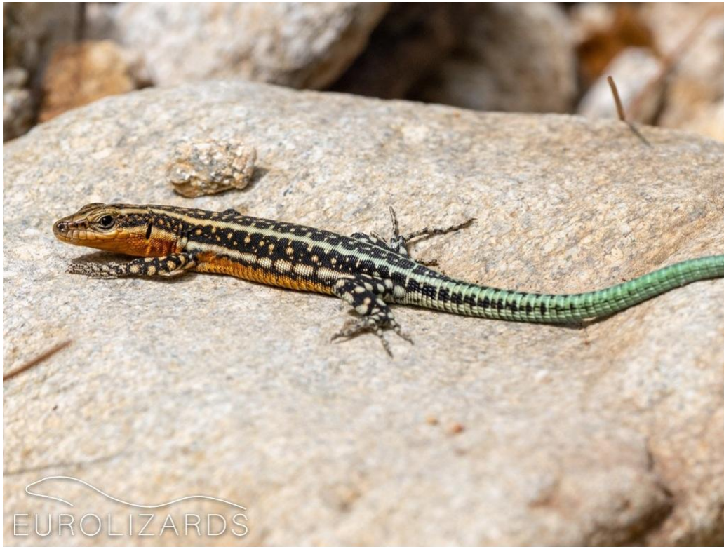
Subsp. oertzeni, juvenile: GR / Ikaria, 11.06.2019 - Juveniles show bright colors and greenish tails.