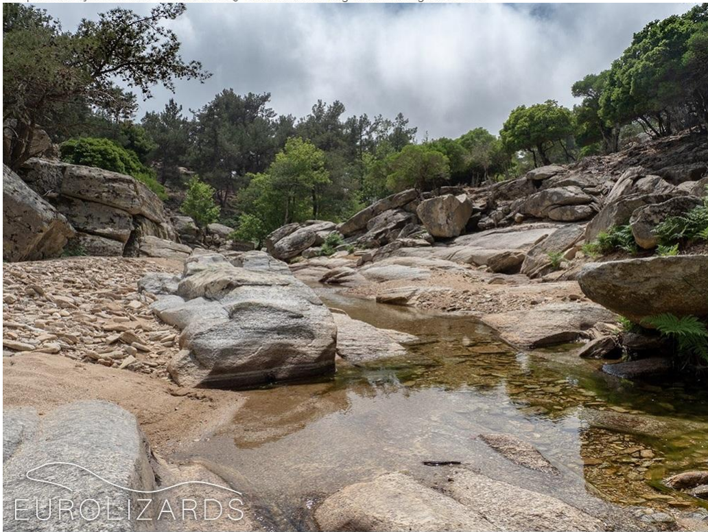
Habitat of Anatololacerta anatolica on Ikaria.