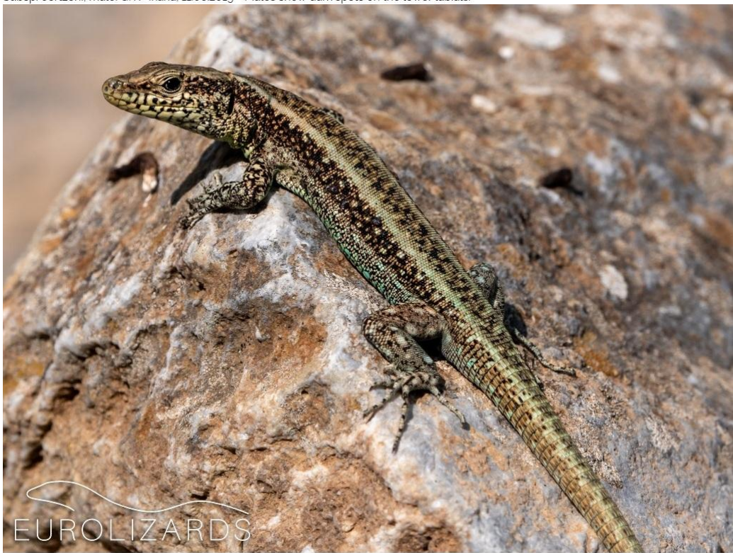
Subsp. oertzeni, male: GR / Ikaria, 12.06.2019 - Adult males show brownish colors.