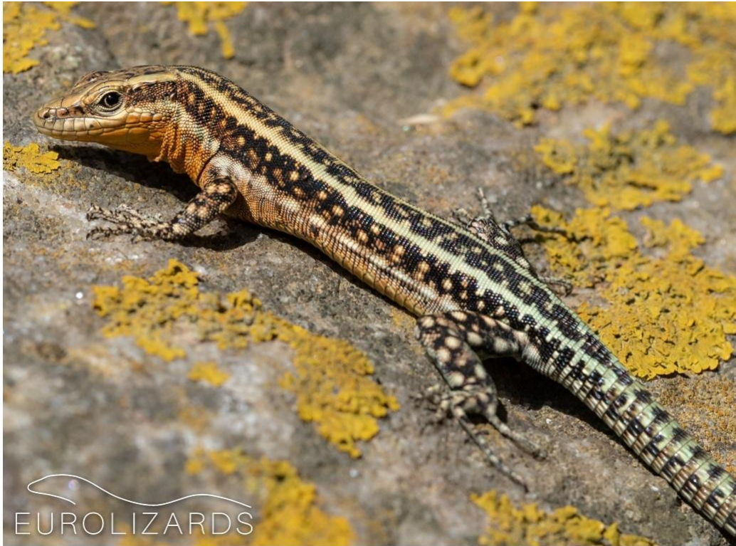
Subsp. oertzeni, female: GR / Ikaria, 12.06.2019 - Females show orange undersides and a contrasting pattern.