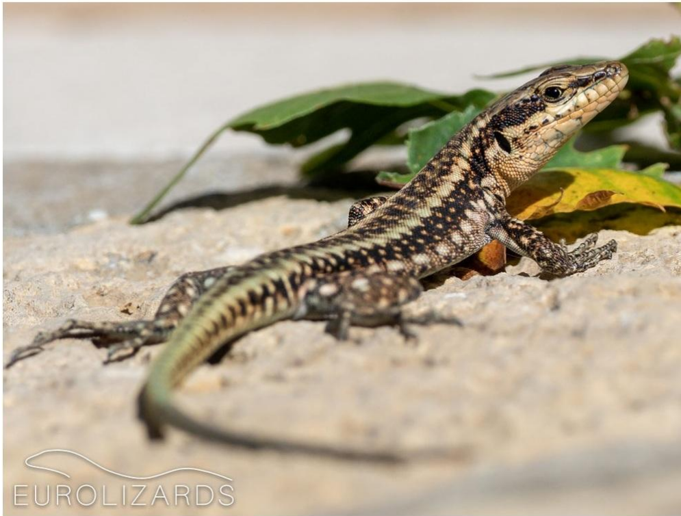
Subsp. aegaea, male: GR / Manolates (Samos), 15.06.2019

In Asia Minor, the European genus Podarcis is replaced by the genus Anatololacerta . In our area, these lizards occur on some Greek islands, only. It is a well climbing species which prefers rather humid habitats. In our area, two quite different subspecies occur: Subsp. aegaea is present on Samos and subsp. oertzeni occurs on Ikaria.