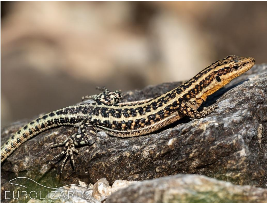
Subsp. oertzeni, female: GR / Ikaria, 13.06.2019 - Note the heavy back pattern.