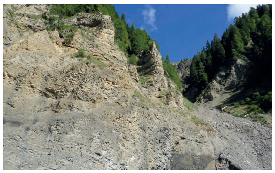
Figure 2 - Sector of the Zahre area / Settore dell'area Zahre

or slight, with a wood of Norway spruce Picea abies , European larch Larix decidua and European beech Fagus sylvatica only in short stretches.