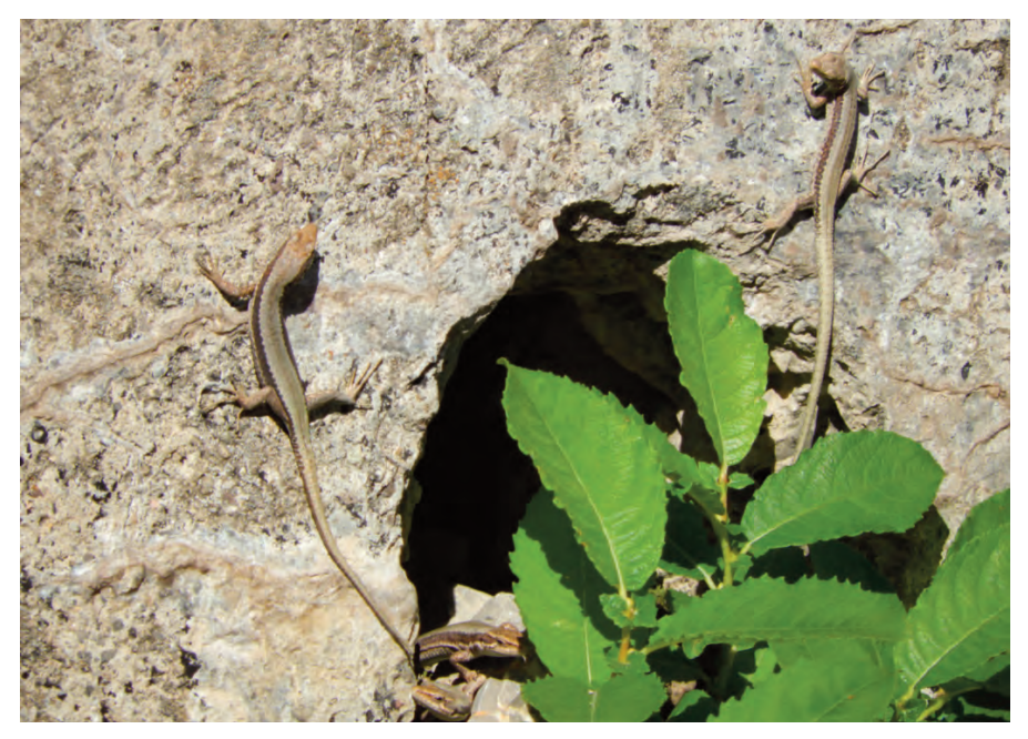
Figure 5 - Iberolacerta horvathi. Grouped individuals (Zahre area) / Individui raggruppati (Area Zahre)

The mean distance between grouped individuals was 8.12 \text{ m} \pm 4.87 \text{ SD} in the Lumiei Valley (Fig. 5) and 4.97 m \pm 3.25 \text{ SD} in the Raccolana Valley.