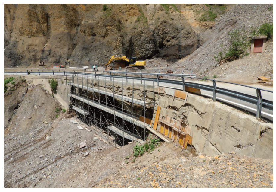
Figure 7a - Renovation works of a bridge (Lumiei Valley) / Lavori di ristrutturazione di un ponte (Val Lumiei)