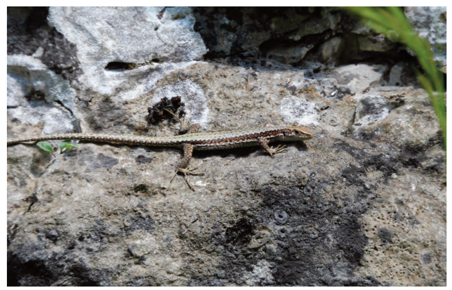
Figure 4c - Iberolacerta horvathi . Adult (Mount Pighera, Taibón Agordino, Dolomites) / Adulto (Monte Pighera, Taibón Agordino, Dolomiti)