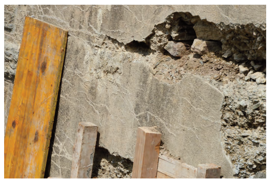
Figure 7b - Two individuals of Iberolacerta horvathi in the zone being renovated / Due individui di Iberolacerta horvathi nella zona in ristrutturazione