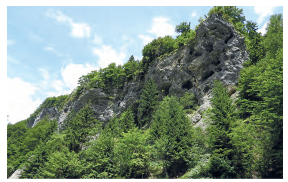
Figure 3 - Sector of the Sclûse area / Settore dell'area Sclûse

The second (Sclûse area; Municipality of Chiusaforte; UM 83; 990-1090 m a.s.l.; Fig. 3), on the lower slope (with prevalent SE exposure) of the Jôf di Montasio group,