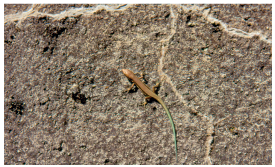
Figure 4a - Iberolacerta horvathi. Neonate (Mount Brizzia, Pontebba, Carnic Alps) / Neonato (Monte Brizzia, Pontebba, Alpi Carniche)