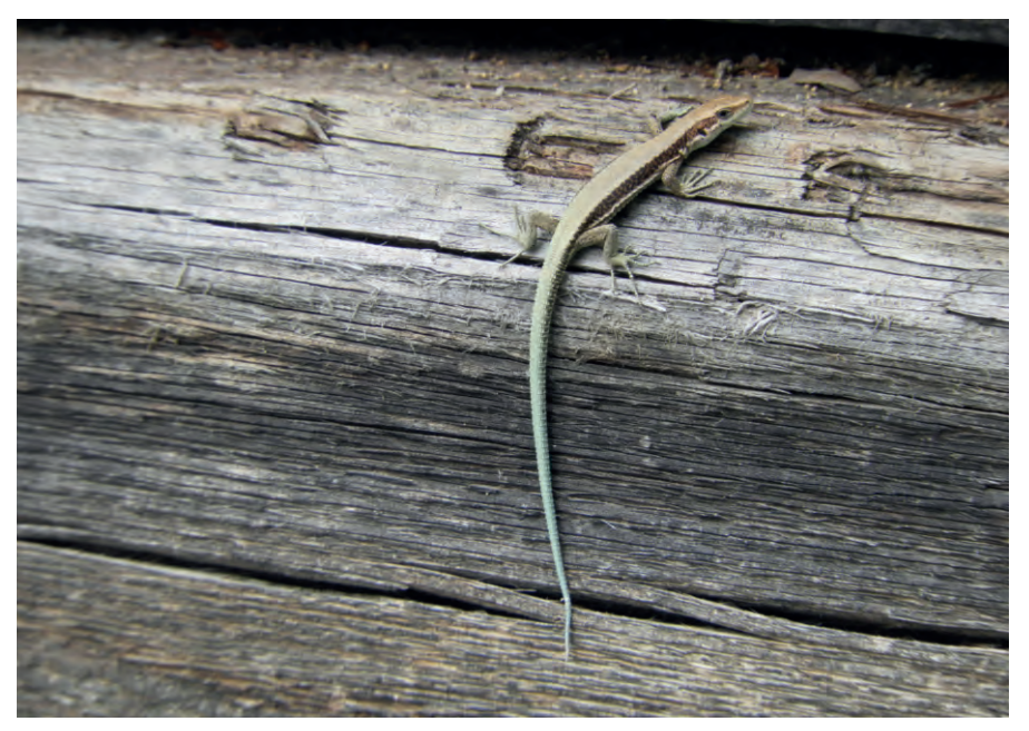
Figure 4b - Iberolacerta horvathi. Juvenile of about 10 months (Mount Palone, Vigo di Cadore, Carnic Alps) / Giovane di circa 10 mesi (Monte Palone, Vigo di Cadore, Alpi Carniche)