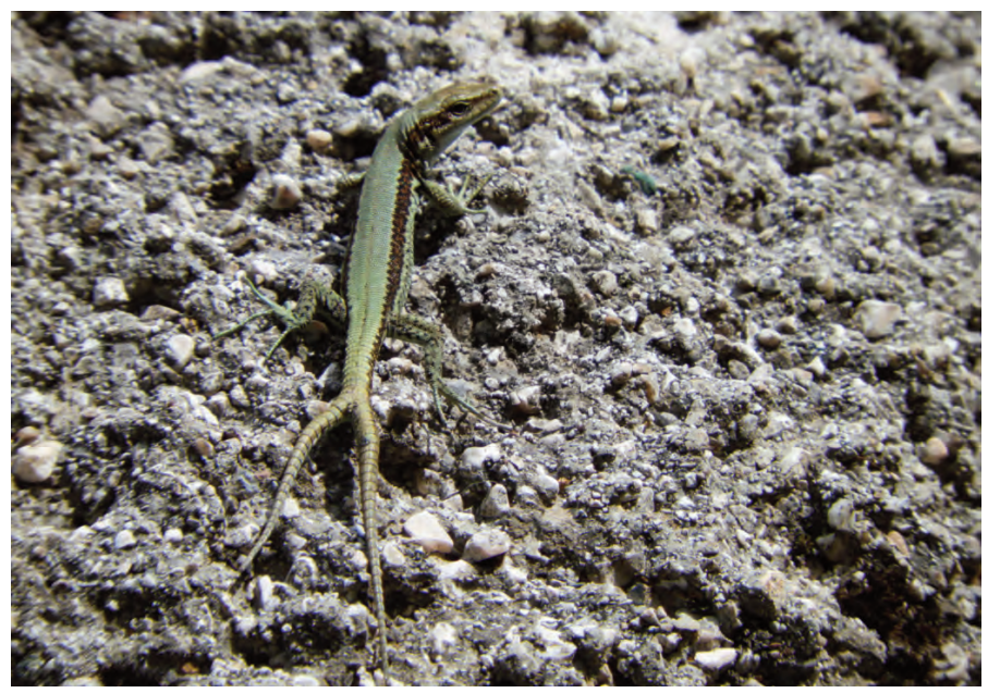
Figure 6 - Iberolacerta horvathi. Individual with bifid tail (Raccolana Valley, Julian Alps) / Individuo con coda bifida (Val Raccolana, Alpi Giulie)