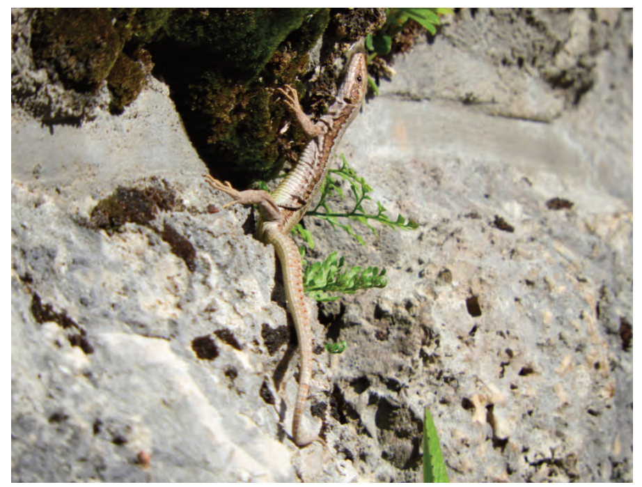
Figure 4d - Iberolacerta horvathi. Adult (Selve, Chiusaforte, Julian Alps) / Adulto (Selve, Chiusaforte, Alpi Giulie)