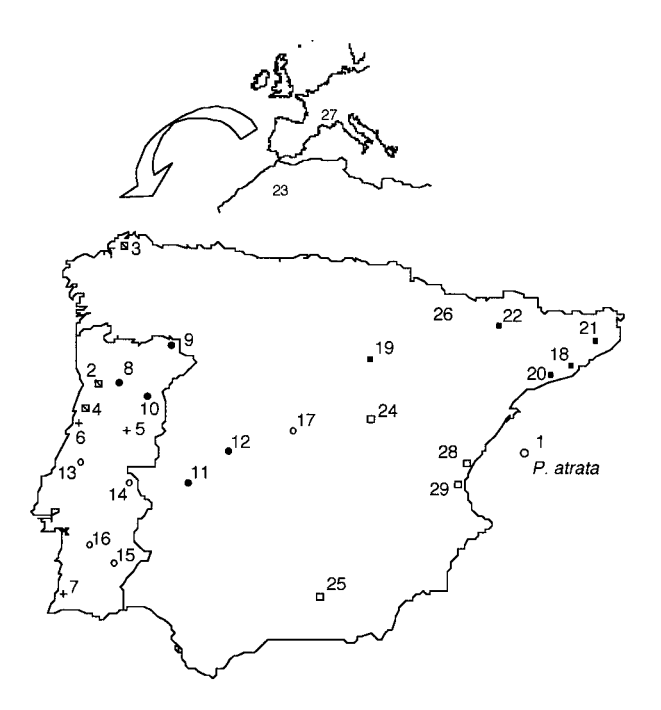
FIG. 1. Map showing the localities of specimens included in this study. Different species and morphotypes are represented as P. atrata (circle, endemic to Columbretes islands), P. bocagei (square with stripe), P. carbonelli (crosses), P. hispanica 1 (black circle), P. hispanica 2 (open circle), P. hispanica 3 (black square), and P. h. hispanica (open square). Numbers refer to Table 1.

sequenced for this study. In all cases sequences from the cytochrome b and 12S rRNA belonging to the same individual were merged in the subsequent analysis and aligned using Clustal W (Thompson et al., 1994). Cytochrome b and 12SrRNA sequences were, respectively, 306 and 414 bp long. The cytochrome b sequences contained no indels. Alignment of the 12S rRNA required insertions in six places. Assessment of saturation in each gene by plotting numbers of transitions and transversions against uncorrected distances indicated that they were not saturated (Fig. 2). Therefore all positions were included in the analysis. The data were imported into PAUP* 4.0b5 (Swofford, 2001) for phylogenetic analysis. When estimating phylogenetic relationships among sequences, one assumes a model of evolution. We used the approach outlined by Huelsenbeck and Crandall (1997) to test 56 alternative models of evolution, employing PAUP* 4.0b5 and Modeltest (Posada and Crandall, 1998) described in detail in Harris and Crandall (2000). Once a model of evolution was chosen, it was used to estimate a tree using maximum-likelihood (ML) (Felsenstein, 1981) with random sequence addition. Support for nodes was estimated using the bootstrap (Felsenstein, 1985) technique, with 1000 replicates. A maximum-parsimony (MP) analysis was also carried out (100 replicate heuristic search) with random sequence addition, and support for nodes was estimated using decay analysis