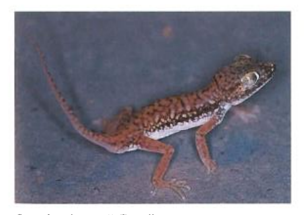
Stenodactylus petrii. Zaranik.