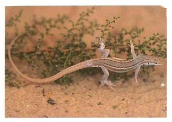
Mesalina olivieri. Zaranik.