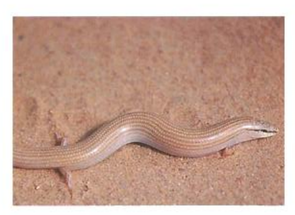
Sphenops sepsoides. Zaranik.