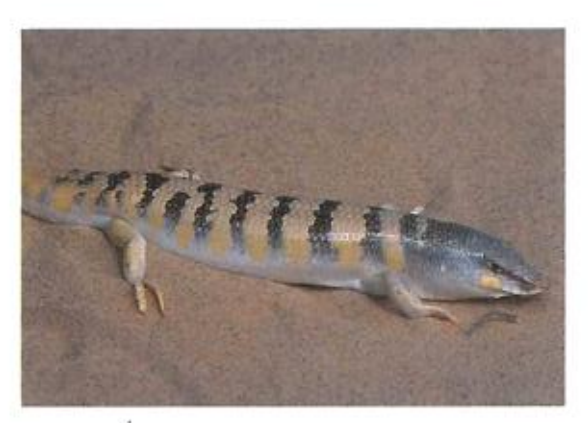
Scincus scincus. Zaranik.