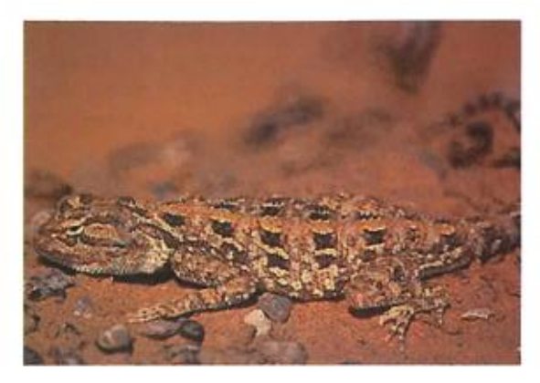
Trapelus savignii. Zaranik.