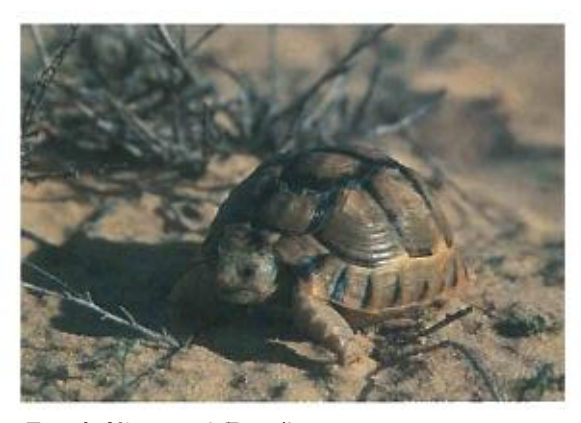
Testudo klienmanni. Zaranik.