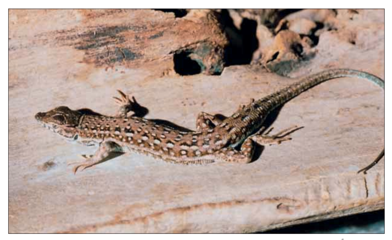
Fig. 2. General view of male Mesalina brevirostris brevirostris specimen collected from Ceylanpınar.