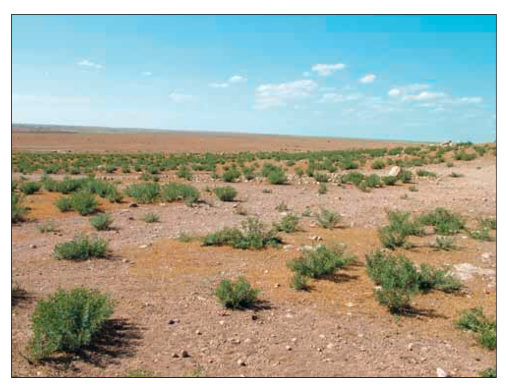
Fig. 4. Habitat of Mesalina brevirostris Ceylanpınar, Şanlıurfa, southeastern Anatolia.