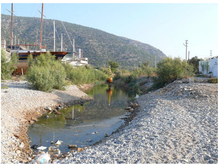
[31] Pelophylax site – stream mouth on the pebble beach in the centre of the village of Yaliçiftlik.