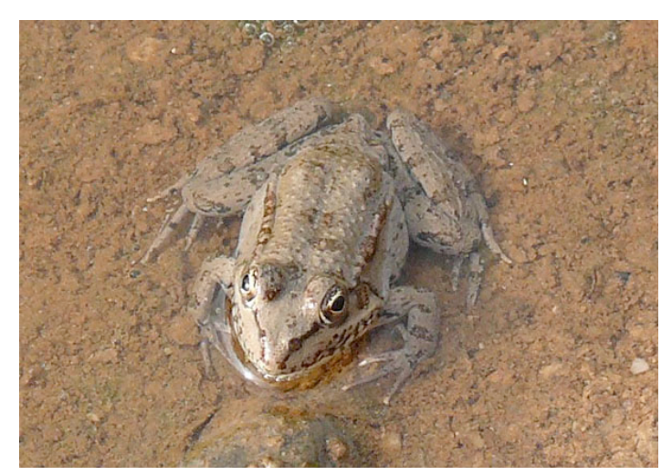
[29] Pelophylax cf. bedriagae, juvenile.