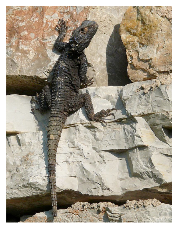
[9] Male Starred Agama, Stellagama stellio daani.