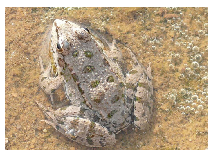
[30] Pelophylax cf. bedriagae, juvenile.