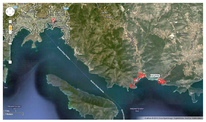
[2] Satellite image Bodrum – Yalliçiftlik with indication of localities where herps were encountered.