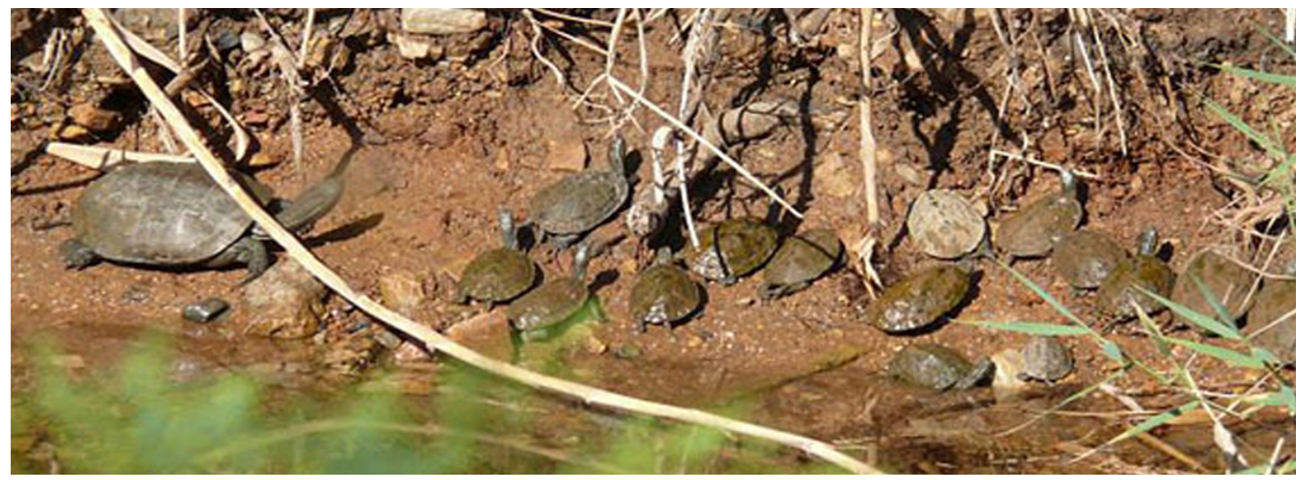
[21] Balkan Terrapins, Mauremys rivulata, of all age classes.