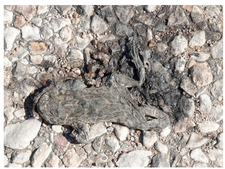
[32] Roadkill of female Green Toad, Bufo variabilis.