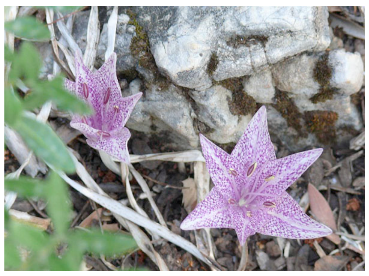
[35] Colchicum variegatum Late Autumn crocus

WIKIPEDIA - Späte Schachbrett-Herbstzeitlose - Downloaded 2012-Dec-23.