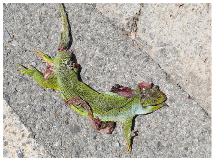
[25] Lacerta trilineata diplochondrodes.