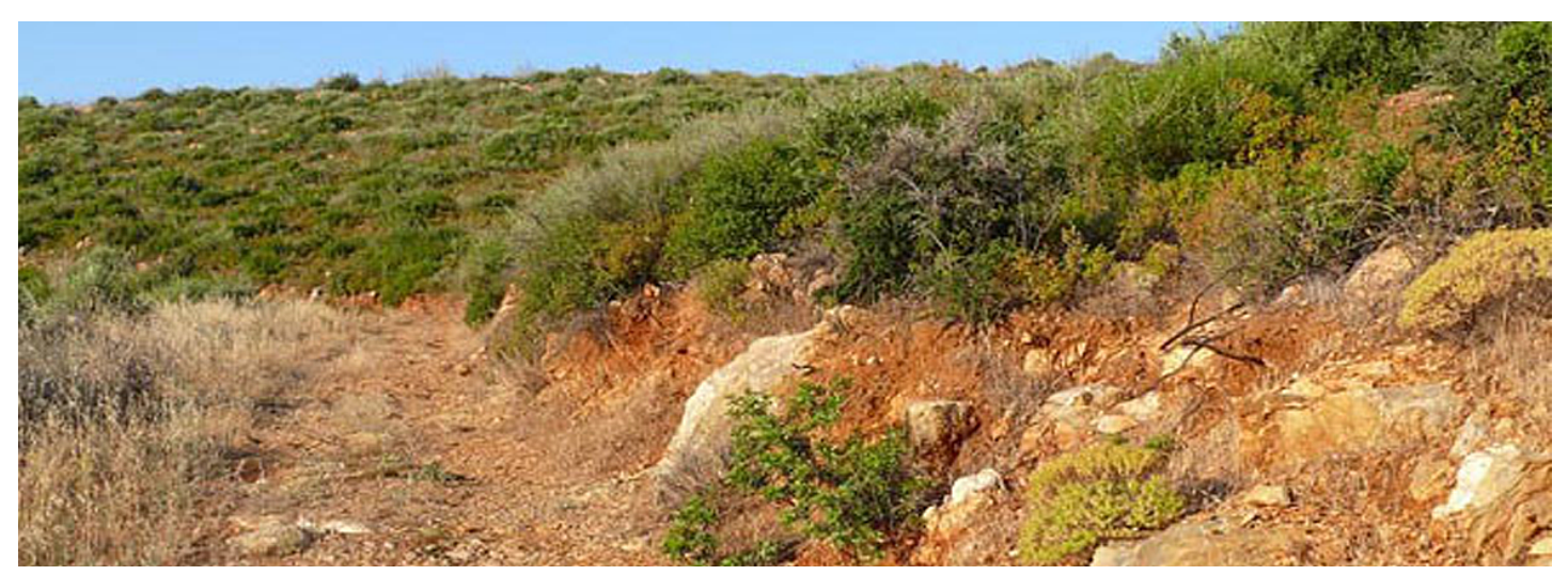
[18] At this site of release of the Ottoman viper, there was a sighting of a fleeing Anatolian Large Whip Snake and the encounter of the Predatory Bush Cricket (Fig. 33). The habitat is covered with chaparral succession vegetation after a wildfire which destroyed the former pine wood there and which reportedly took place two years ago.