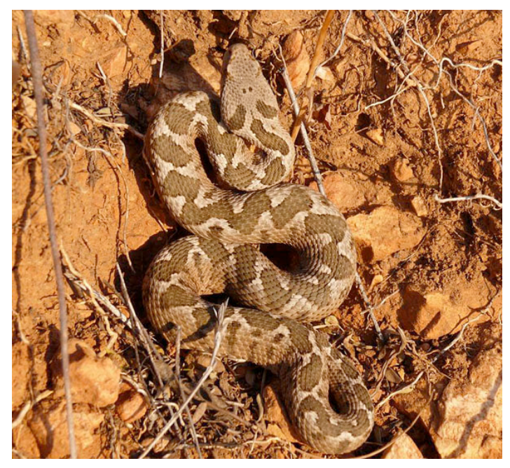
[14-17] Juvenile Ottoman viper Montivipera xanthina (taken shortly after sunrise in light with a high proportion of red which was deliberately not corrected digitally)