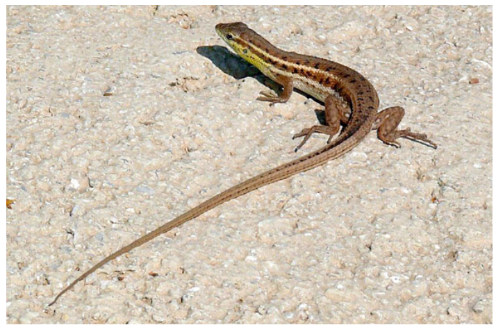
[12] Female Ophisops elegans macrodactylus