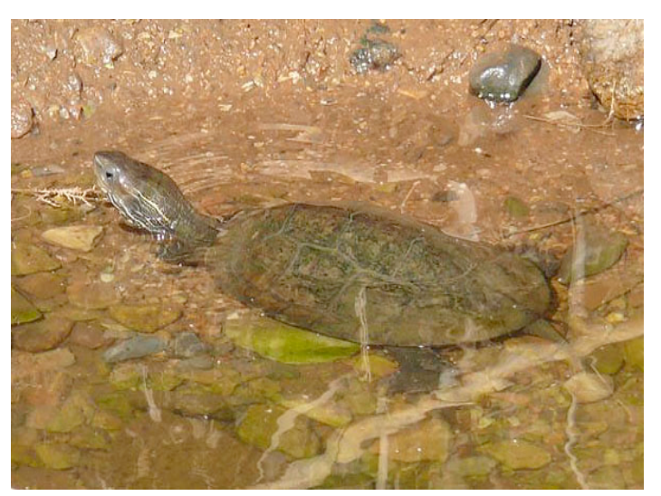
[22] Mauremys rivulata, adult.