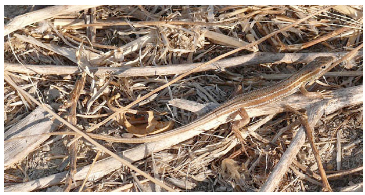
[13] Hatchling of the Snake-eyed lacertid.