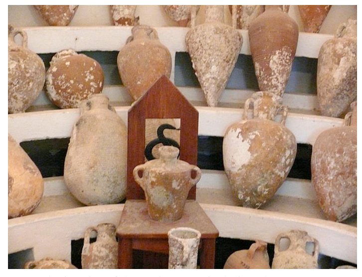
[5] The interior oft he snake tower is designed as a symposium of amphorae around a snake chair.