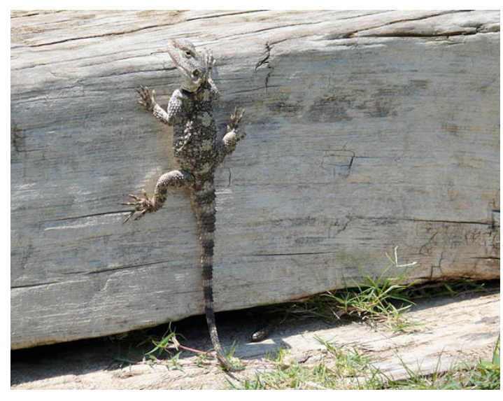
[8] Female Starred Agama, Stellagama stellio daani.

According to hotel personnel, snakes ("Black Mountain Snake") visit the hotel gardens occasionally. Near a hotel resort I observed a fleeing Dolichophis j. jugularis in June and I found a snake's dress with 19 scales around the middle of the body, matching this species, in October.