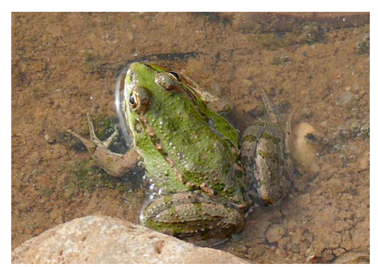
[28] Pelophylax cf. bedriagae , juvenile.

I am indebted to MICHAEL FRANZEN who describes the present state of discussion in an email to me of 20 November 2012: "PLÖTNER et al (2012) offer the most recent state of the region's Water Frogs. They refer to animals from western and central Anatolia as P. cf. bedriagae 2 and those from the south-east as cf. bedriagae 1 in the cladogram on p. 271. Hence you are on the safe side with the indication Pelophylax cf. bedriagae." (Translation: GD)