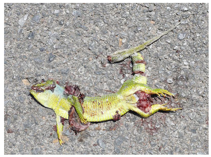
[24-25] Roadkill of a male Balkan Green Lizard.