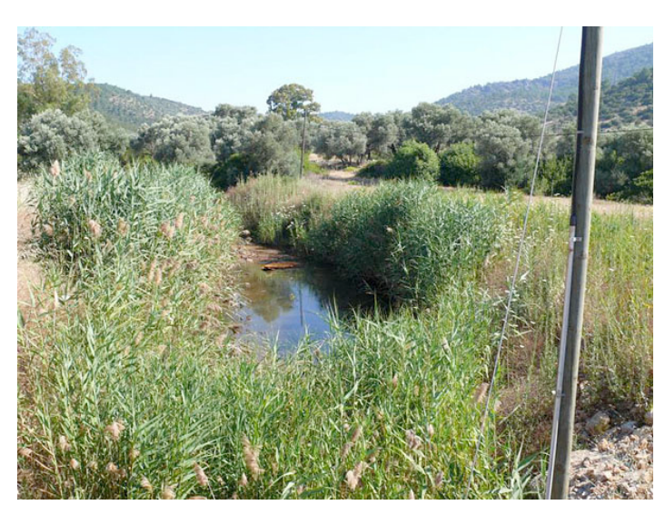
[23] Beginning of the water carrying mouth section of a stream which fell dry upstream with Mauremys and Bufo variabilis as well as Lacerta trilineata nearby.