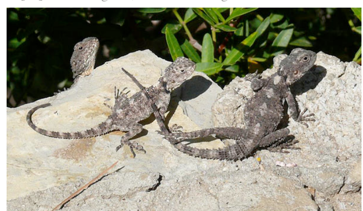
[11] Starred Agama, group of hatchlings.