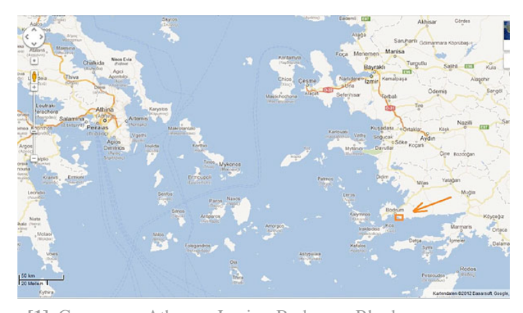
\label{eq:continuous} \textbf{[1]} \ \ Gross\ map\ \ Athens-Izmir-Bodrum-Rhodes.

FRANZEN et al. (2008) name 65 species of amphibians and reptiles for south-western Turkey. Bearing this in my mind, I had high herpetological expectations during two beach holidays in hotel resorts in the village of Yaliçiftlik, approximately 8 km SE of the city of Bodrum in the province of Muğla from June 4 - 11 and October 1 - 8 in the year 2012. I did not survey the area in a systematic manner but did rather document random trailside encounters and their circumstances.