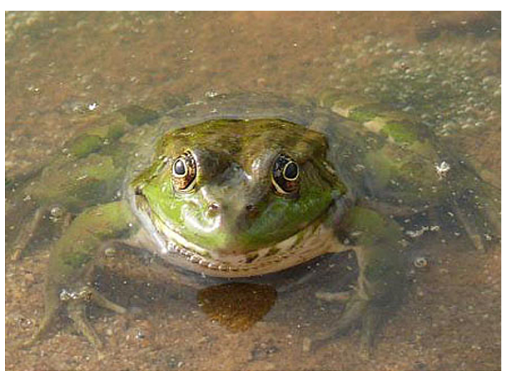
[26] Pelophylax cf. bedriagae, adult female.