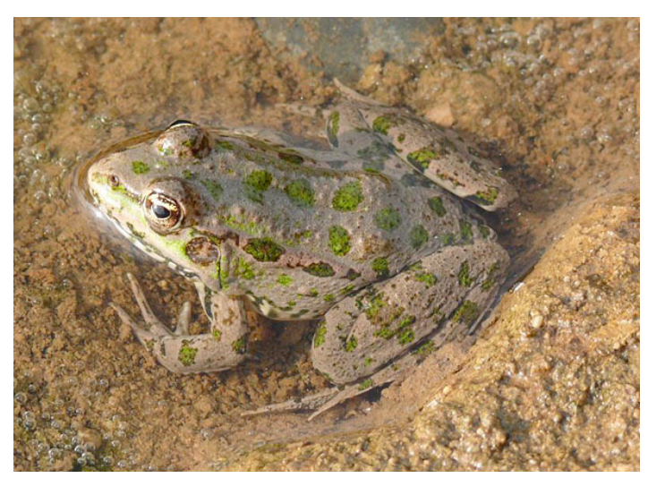
[27] Pelophylax cf. bedriagae, juvenile.