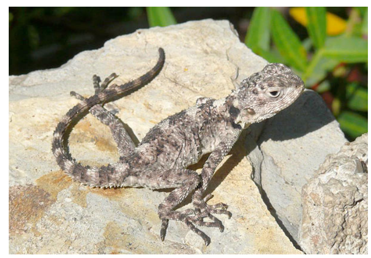
[10] Starred Agama, female hatchling.