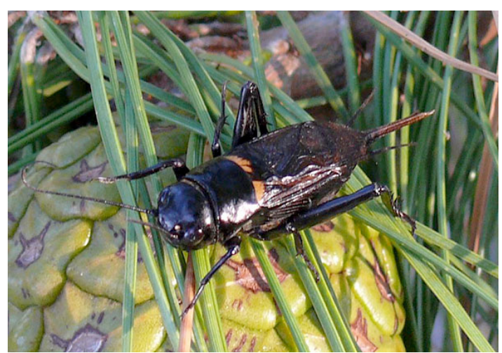
[34] Gryllus bimaculatus, female.