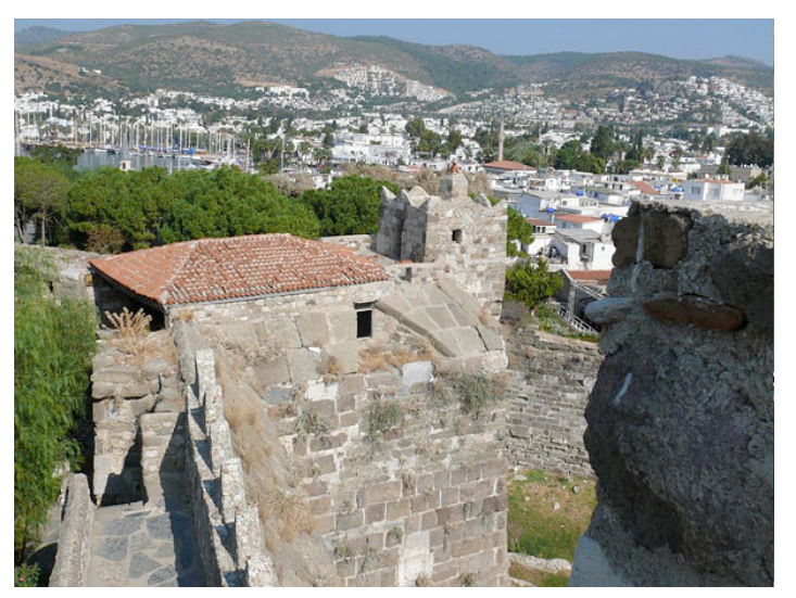
[3] View towards the City of Bodrum from the castle.

The archeological sites "Lindos Gate" and "Mausoleum of Halicarnassos" (one of the ancient seven wonders of the world) turned out to be reptile negative during a visit around noon in June. In the fountain area of the Mausoleum no frogs were observed despite there being abundant water- and swamp-vegetation.