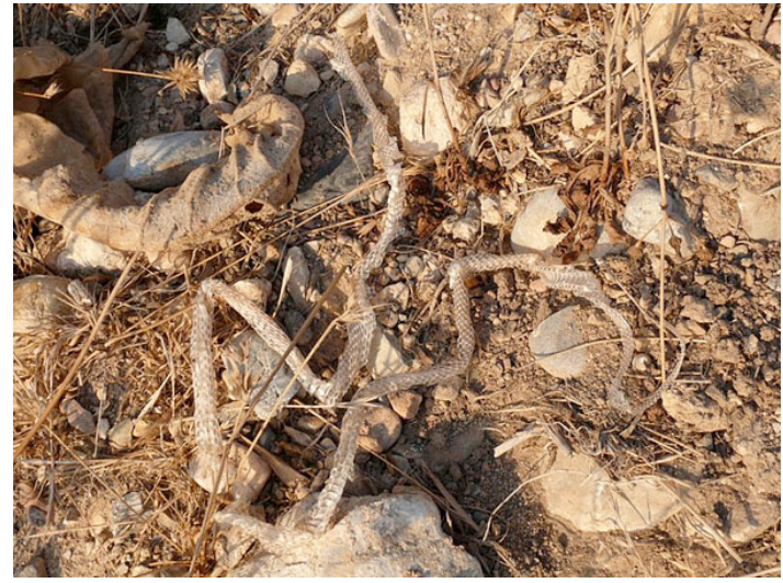
[19-20] Dress of an Anatolian Large Whip Snake, Dolichophis j. jugularis .