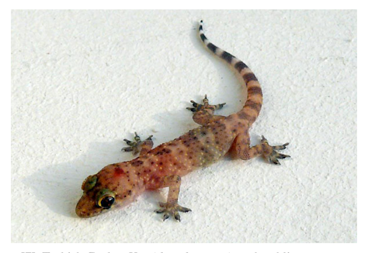
[7] Turkish Gecko, Hemidactylus turcicus, hatchling.