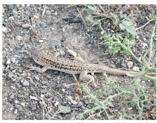
Figure 2. Dorso-lateral view of Eremias strauchi kopetdaghica from Khorasan province.