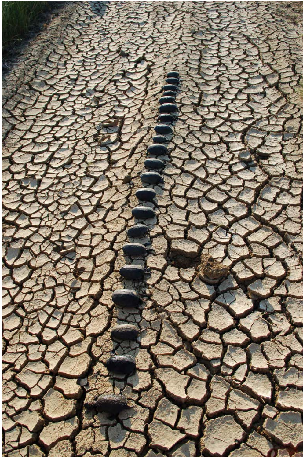
Figure 2. At Kolansko blato on the island Pag (Croatia) we found a fish trap with 21 dead Emys orbicularis inside.

Slika 2. Na lokalitetu Kolanjsko blato na otoku Pagu (Hrvatska) pronašli smo vršu sa 21 mrtvih jedinki vrste Emys orbicularis .