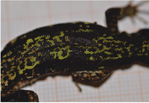
Figure 2. Partially-melanic individual of Common Wall Lizard ( Podarcis muralis ) observed on the Monte Morello (Tuscany).

only a few occurrences of full melanism are known in this species, with these being occasional findings rather than recurring polymorphism (Trócsányi and Kórsós, 2004). However, no occurrences have been reported for central Italy.