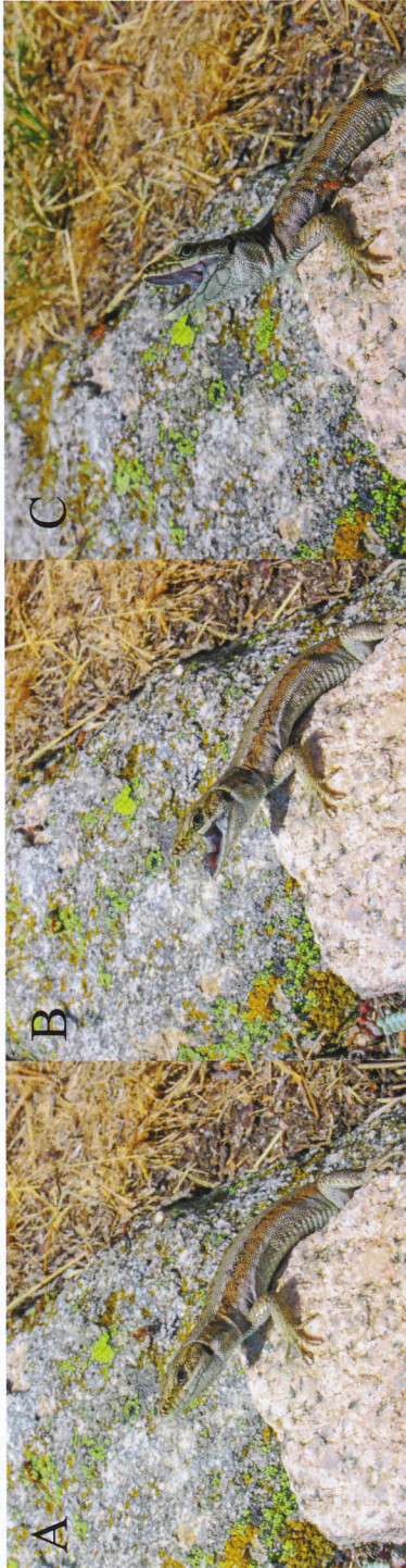
Fig. 1: Sound production in a female of Iberolacerta cyreni (MÜLLER & HELLMICH, 1937), from the Sierra de Guadarrama, Madrid, Spain. Three consecutive phases are represented: A – relaxation phase before sound emission; B – abrupt air expiration by rapid thoracic compression of lungs at the time of mouth opening; and C – up and backward movement of the head at right angle to the ground, thorax relaxation, and mouth closure.

age of 11 ms ( < 10\% of rise ratio). The spectral structure of the vocal sound is characterized by the presence of several frequency bands, starting at 1.0 kHz, a discrete frequency modulation, and 3.0 kHz of dominant frequency. Sound activity lasted around two min during which three series of squeaks were uttered. Inter-series interval was longer than duration of the series and the subject allocated such pauses to change its position before restarting sound production.