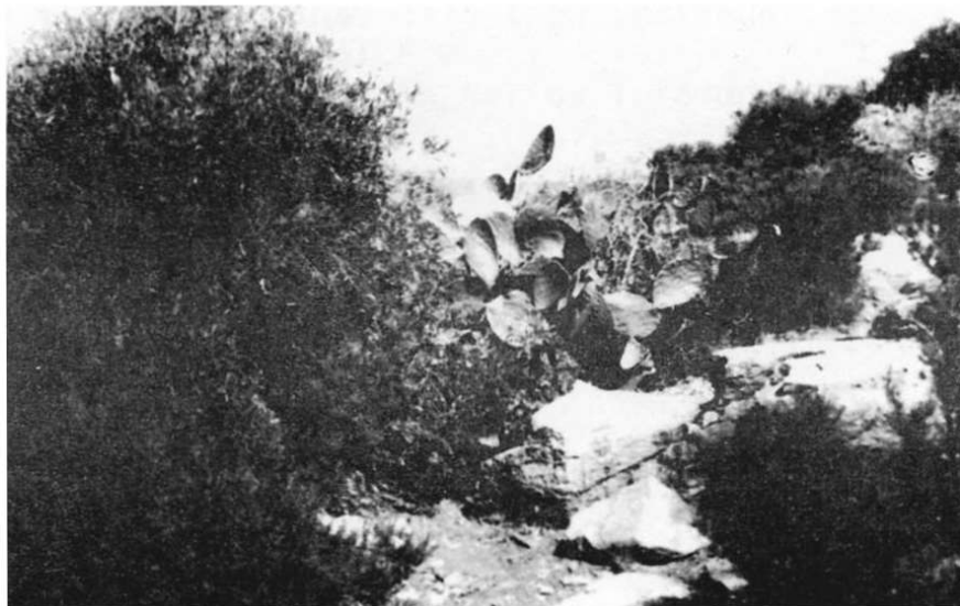
fig. 3 Lizard habitat on Isla de Benidorm

The validity of this form requires further examination.