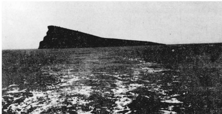
fig. 4 Isla de Benidorm, seen from the mainland