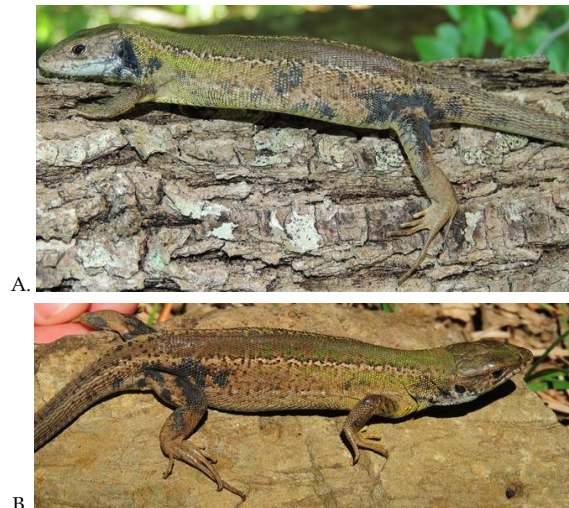
Figure 1. Partially melanistic female Lacerta viridis meridionalis (A. - left side; B. - right side).

3.) We note here a highly intriguing case of L. v. viridis with a bifurcated tail (Stojanov et al. 2011, Fig. 402). The authors only mention the bifurcation in the figure caption, but we include this observation here as the secondary tail also bears signs of melanism (Fig. 2). Typically, in lacertids, the re-growing tail after an autotomy differs from the original not only in a replacement of the bone with cartilage but in coloration – ranging from paler to darker than the original and usually with less patterning. We did not observe melanism on the additional tail upon inspection of published images and descriptions of lacertids with bifurcated tails: e.g. a case of a Bosk's Fringe-fingered Lizard Acanthodactylus boskianus asper without a seeming change in coloration (Tamar et al. 2013); a Sand Lizard L. agilis with no change in color, and a Z. vivipara , with a slight change (Dudek & Eknér-Grzyb 2014); and an Erhard's Wall Lizard Podarcis erhardii with a discolored tail lacking the black striped pat-