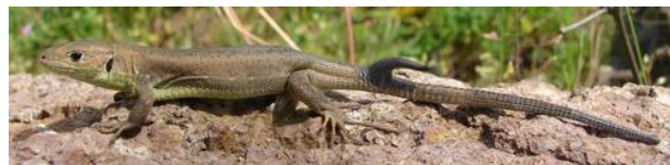
Figure 2. Partially melanistic Lacerta v. viridis with a bifurcated tail, mentioned in Stojanov et al. (2011).

tern (Brock et al. 2014). Thus, the cause for such extreme change in coloration we present here is still to be identified.