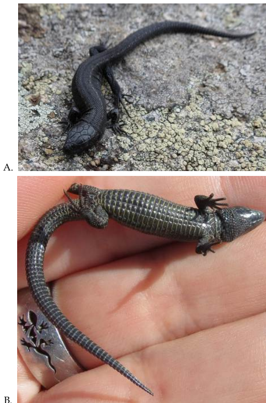
Figure 4. Juvenile melanistic Zootoca vivipara . (A. – dorsal view; B. – ventral view).

The observations presented here are the only ones of complete or partial melanism of lacertids that we know of in Bulgaria. Based on our personal unpublished data, we presume that, in general, the frequencies of melanism in lacertid lizards in Bulgaria are very low (<0.01%): we have over 9,000 records of L. viridis from diverse locations, and 723 of Z. vivipara (including 329 from Vitosha).