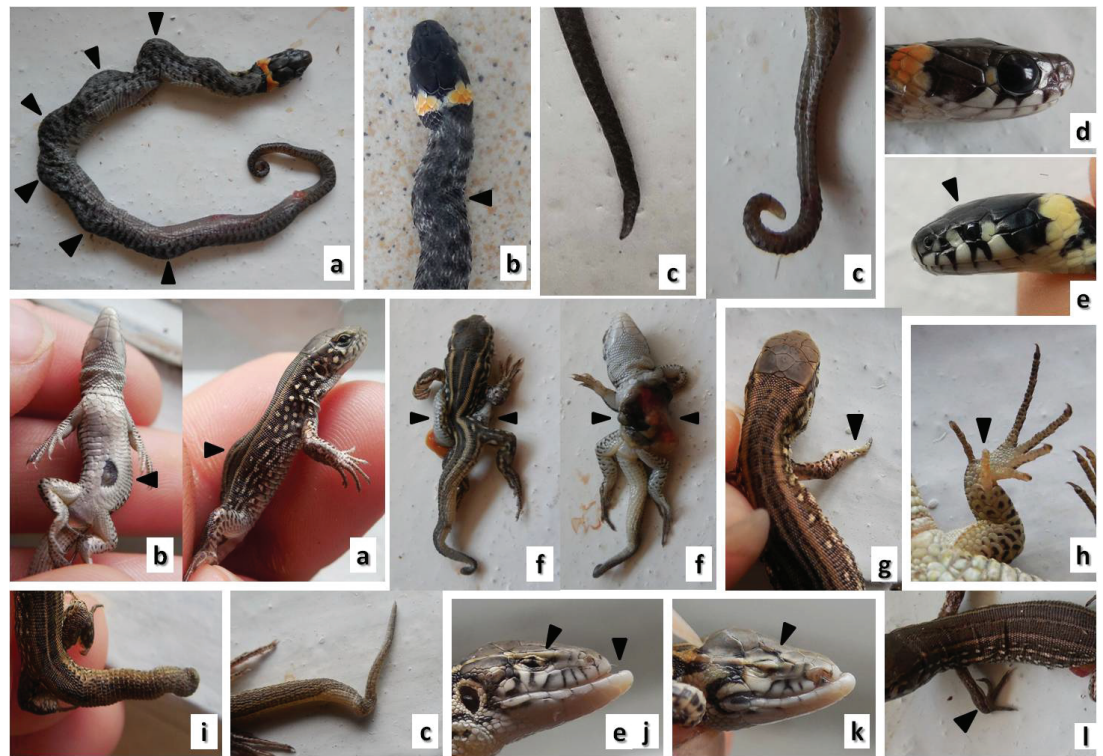
Figure 2: Malformations of grass snakes and sand lizards: a – kyphosis, b – scoliosis, c – tail curvature, d – head deformation, e – microphthalmia, f – shistosomia, g – olygodactyly, h – polydactyly, i – incomplete tail, j – micrognathia, k – anophthalmia, l – inflexible limb.