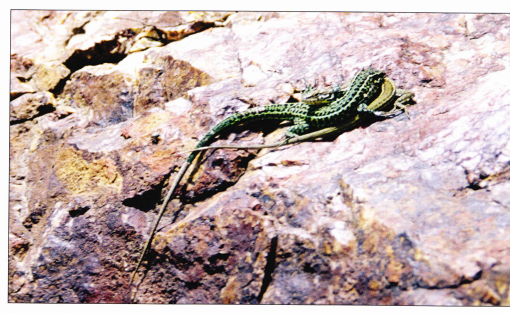
Fig. 79: Podarcis tiliguerta pairing, Asinara Island, NW Sardinia.