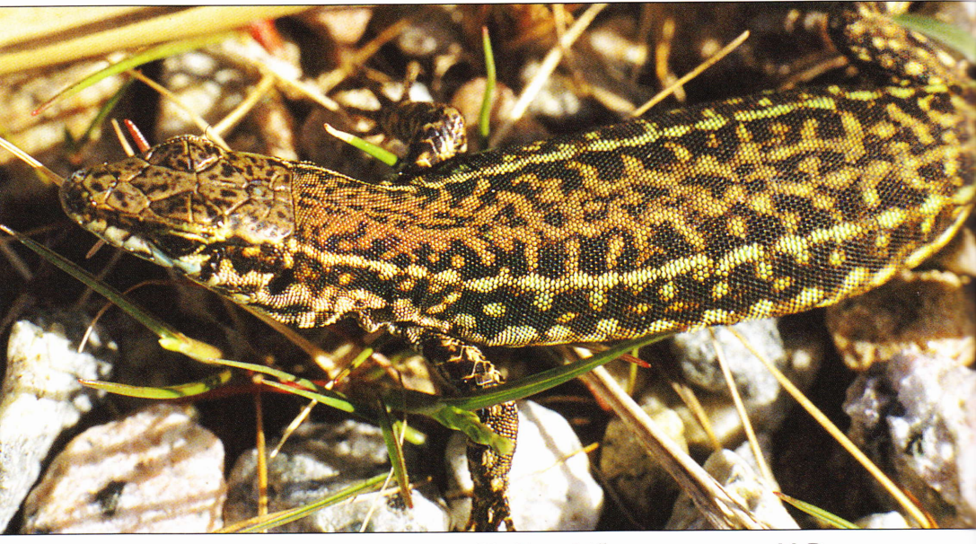
Fig. 78: Podarcis tiliguerta, 9, Corsica, near Verghiu and Albertacce, ca. 2100 m.