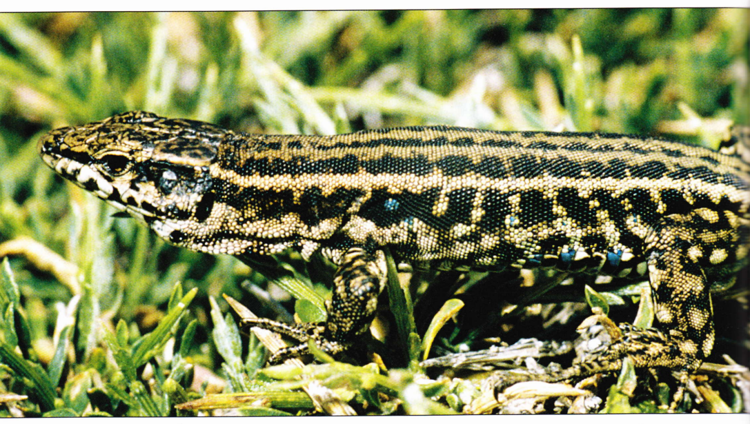
Fig. 77: Podarcis tiliguerta, Col de Verghiu, Corsica, France.