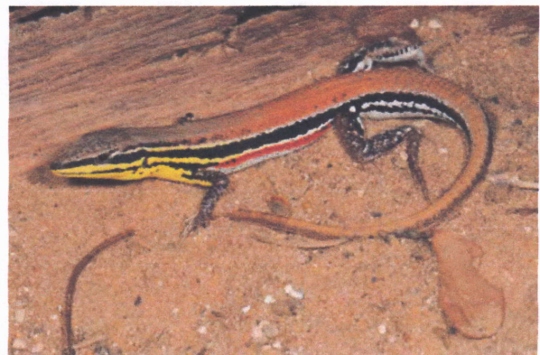
Ichnotropis capensis —Caprivi Strip, Namibia