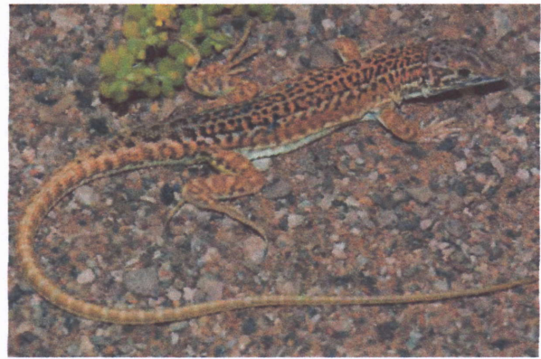
Meroles suborbitalis —Farm Eselkopvlakte, WNW of Loeriesfontein, NC