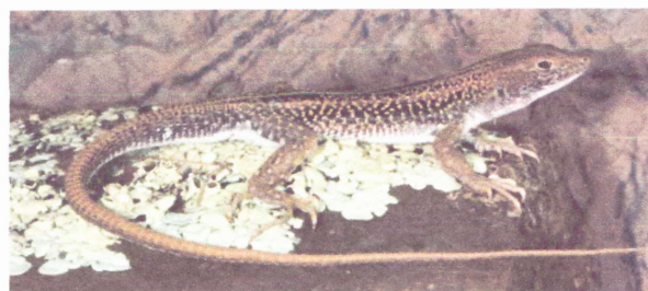
Pedioplanis laticeps —Sutherland, NC