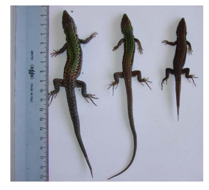
Fig. 1 Male lizards from Exo Diavates ( left ), Lakonissi ( middle ), and Skyros ( right )

difference disappeared when Lakonissi and Exo Diavates were removed ( \chi^2 =0.199, df=2, P=0.91). Similarly, there were no differences between field and laboratory autotomy rates for most populations (all \chi^2 <0.01, P>0.05) with the exception of Lakonissi and Exo Diavates ( \chi^2 =14.8 and \chi^2 =12.9, respectively, P<0.05) reflecting the presence of extremely strong drivers causing autotomy (Fig. 1).