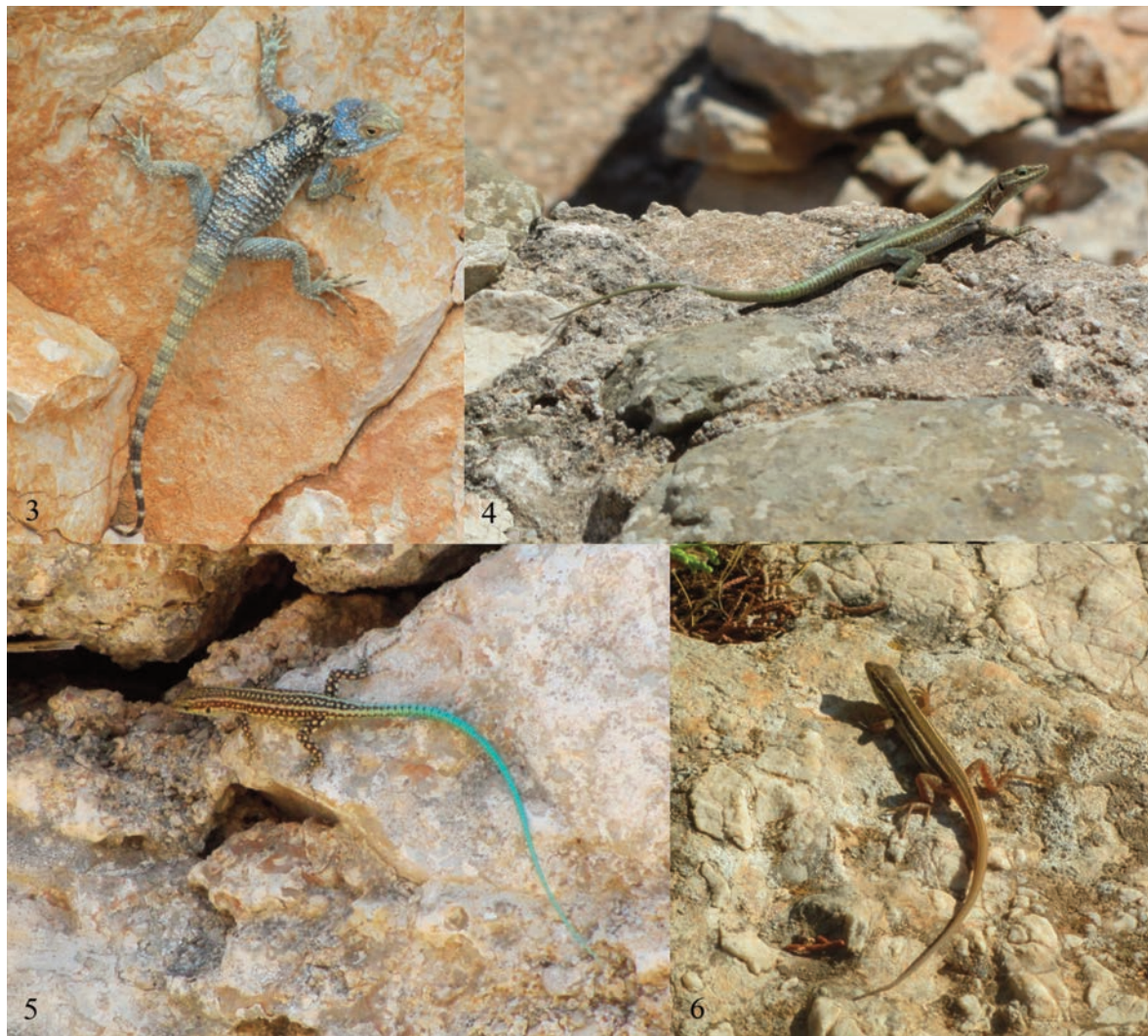
Figures 3–6. Reptiles from Alimia Island. Figure 3. Stellagama stellio daani . Figure 4. Anatololacerta oertzeni pelasgiana (adult). Figure 5. A. oertzeni pelasgiana (young). Figure 6. Ophisops elegans .

Mus musculus commonly called house mouse, is an anthropocore and highly invasive regarded species. This species native of Asia, is present in all continents, except Antarctica (Masetti, 2012).