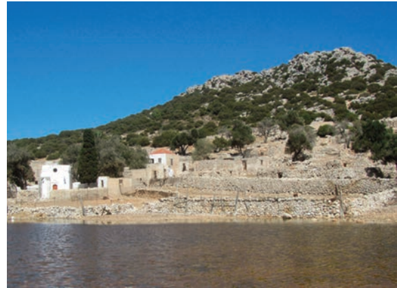
Figure 2. Ag. Georgios village, Alimia Island.

between rocks and among the ruins of Ag. Georgios village.