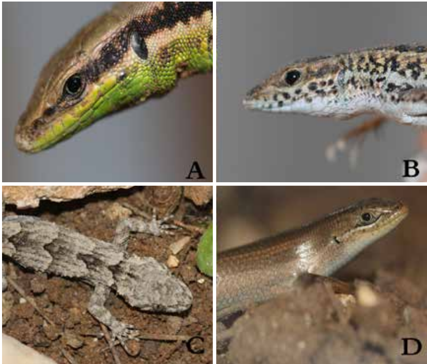
Figure 2. Some lizards from WAQ. A. Phoenicolacerta laevis . B. Ophisops elegans . C. Mediodactylus kotschyi . D. Trachylepis vittata .

The most common species of reptiles observed were Stellagama stellio and Ptyodactylus guttatus with 33 and 32 observations respectively. Stellagama stellio was the most common reptile in WAQ found mostly in exposed areas and at the margins of the wooded areas associated with rocky areas.