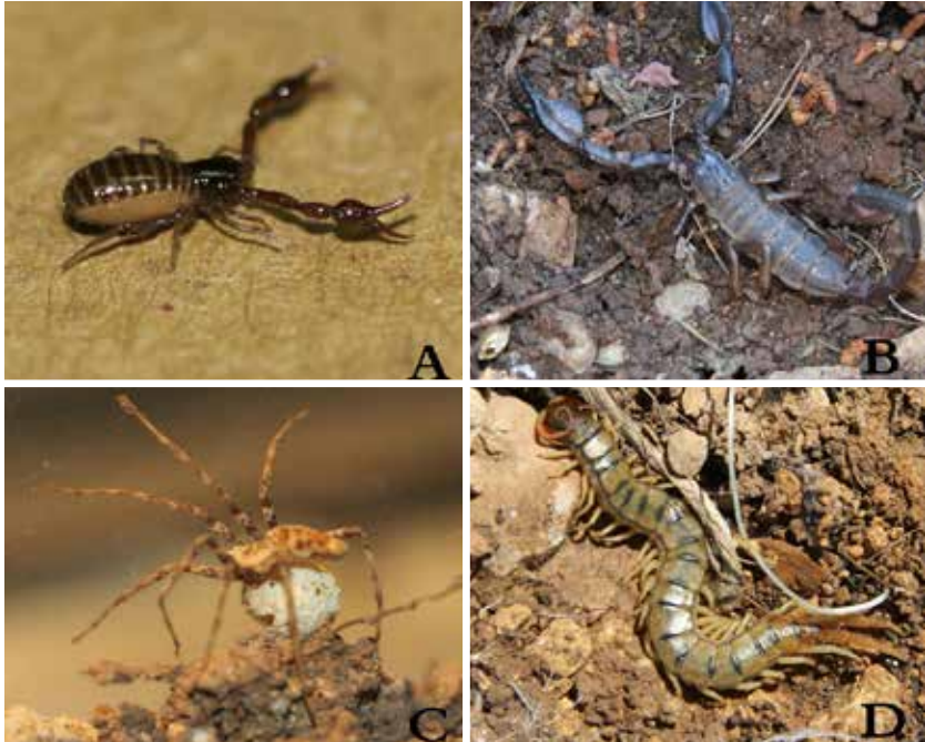
Figure 2. A. Pseudoscorpion. B. Jericho or Mt. Nebo scorpion Nebo hierichonticus . C. A spider of the order Araneae. D. Scolopendra cingulate .

We reported earlier on the species of scorpions from the occupied Palestinian territories including first chromosomal data (Qumsiyeh et al. , 2013). We also published on chromosomes and systematic of Jericho or Mt. Nebo scorpion Nebo hierichonticus (Fig. 2) obtained from Wadi Al-Quff (Qumsiyeh et al. , 2014). That was the first scientific paper to our knowledge to be published mentioning animals specifically from WAQ.