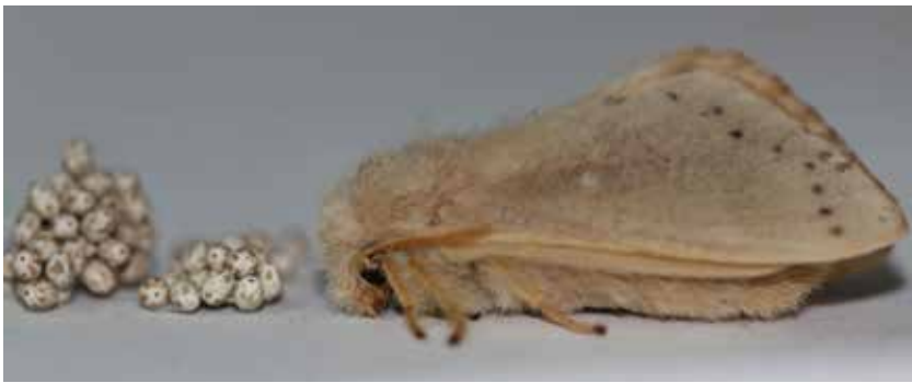
Figure 1. A. The moth Dendrolimus bufo with its eggs (June 2014).