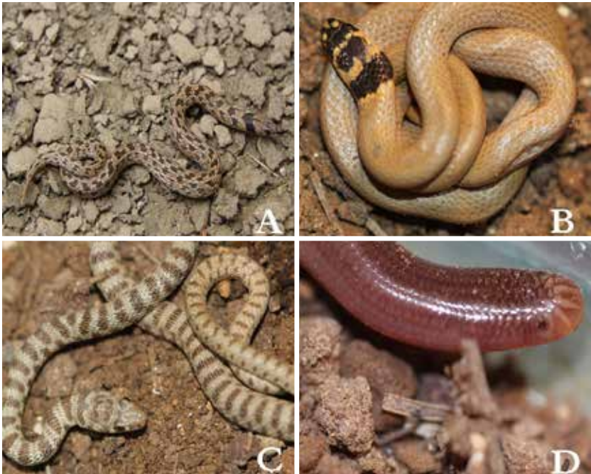
Figure 3: A. Eirenis lineomaculata . B. Eirenis rothi . C. Platyiceps rogersi . D. Typhlops vermicularis .

All reptilian species recorded from the study area are of Mediterranean affinities and were reported from similar Mediterranean areas within the West Bank (Handal et al. , 2016)