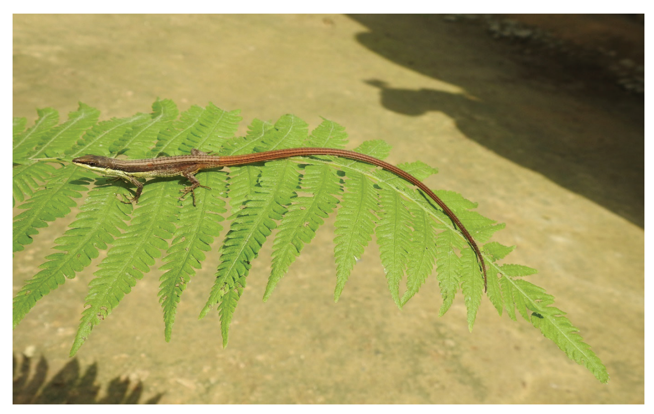
Figure 1. Full body photo of Takydromus sikkimensis from Miklajung, Morang Nepal.

On 8 September 2021, at 15:35 h; the first author observed a specimen during diurnal herpetological surveys in Chure hills of Miklajung, Morang district, Province-01, Nepal. On close observation, it appeared different from other local lizard species known from the area by having a long tail and greenish belly part. This animal escaped when approached. Another individual was sighted ca. 03 km east of the earlier location on the 9 September 2021. The specimen was found in tropical mixed Schima-Castonopsis forest habitat in the upper Chure hills (Chettry et al. 2021) at 720 m msl. The lower grassy vegetation of the locality is characterized by Microlepia speluncae, Brachiaria ramose, Cyathea spinosa, Pteris biaurita, Cynodon dactylon (Ojha and Niroula 2021). The specimen was captured by hand, photographed, and measured with vernier callipers; scales were also counted. After collecting morphometric and meristic data, the specimen was released at the point of capture (Fig. 2).