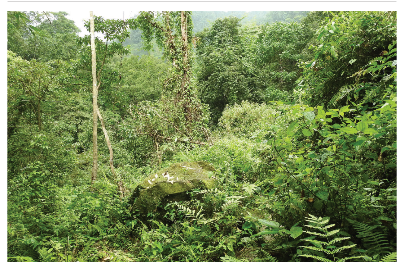
Figure 4. Habitat of Takydromus sikkimensis in Nepal.

(Subedi et al. 2021). Geographically, the Chure hill range covers 12.8% of Nepal's area. However, the biodiversity of the area is poorly documented (Chettry et al. 2021). Fewer studies have been conducted in recent years in Chure hills but they have occasionally resulted in a new herpetofauna species record such as Varanus salvator (Laurenti, 1768) and Hydrophyllax leptoglossa (Cope, 1868) from Nepal's eastern Chure (Bhattarai et al. 2020). In addition to T. sikkimensis , we also recorded other associated reptile species such as snakes; Coelognathus radiatus (Boie, 1827), Dendrelaphis tristis (Daudin, 1803), Lycodon aulicus (Linnaeus, 1758), Oligodon albocinctus (Cantor, 1839), Psammodynastes pulverulentus (Boie, 1827), Rhabdophis helleri (Schmidt, 1925), and lizards such as Calotes versicolor (Daudin, 1802), Cyrtodactylus sp. Hemidactylus sp. Eutropis carinata (Schneider, 1801), E. macularia (Blyth, 1853), Varanus bengalensis (Daudin, 1802).