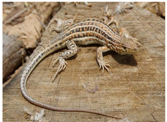
Figure 2. Gravid female Acanthodactylus erythrurus , 17 June

of the four individuals displayed conspicuous red colouration (Fig. 1. B, D), with only one male still displaying very indistinct orange traces on the hind legs (Fig. 1. F). One of the females was observed to be gravid (Fig. 2). On 21st May 2019, a male was observed with colouration of the tail in El Chapatal (36°16' N, 5°26' W; UTM 30S TF 82 18), approximately 3.5 km from the site of the first observations.