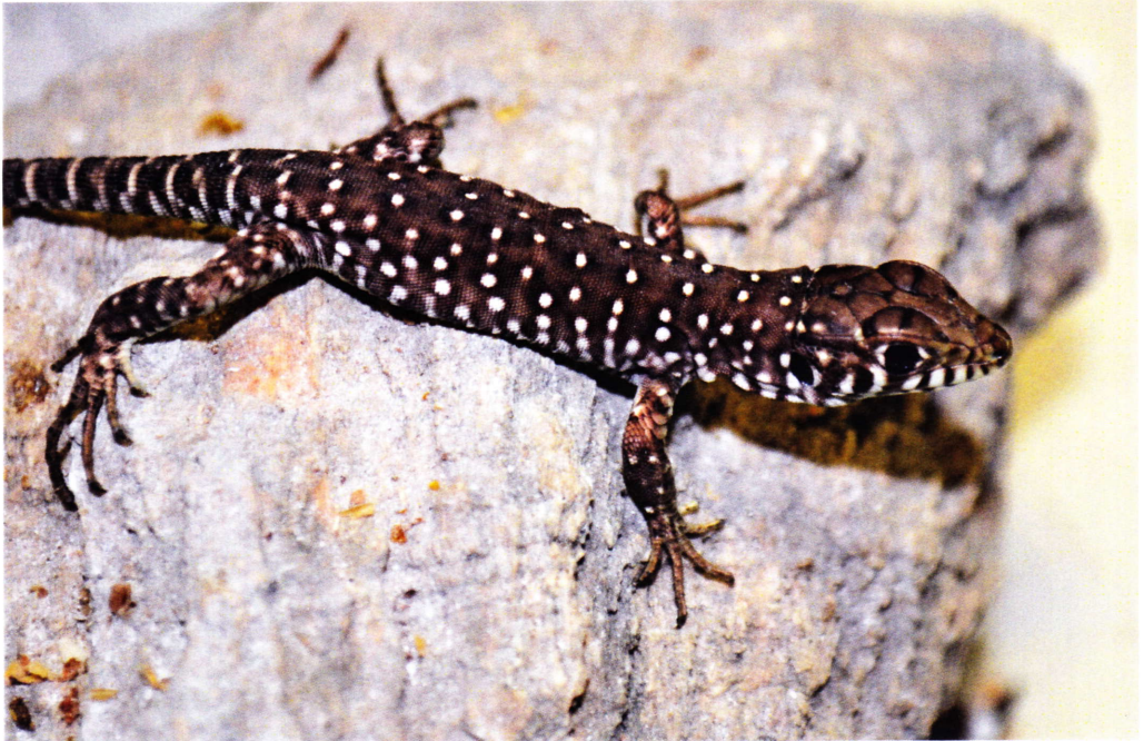
Figure 7 b. One day hatched Timon nevadensis .