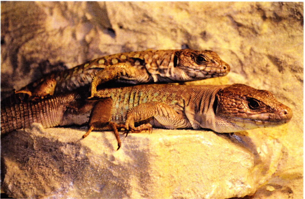
Figure 7 a. Timon nevadensis adult pair.

Features: Compared to T. lepidus , Timon nevadensis has a darker livery with darker colours, from slate gray to dark brown, with light blue or cobalt blue spots. During the breeding season, adult males show a very bright blue colour of the livery, with beautiful metallic reflexions (Fig. 8).