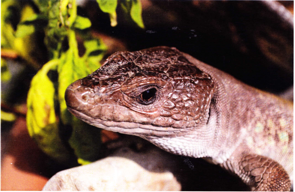
Figure 7 d. Adult male Timon nevadensis , head close-up.