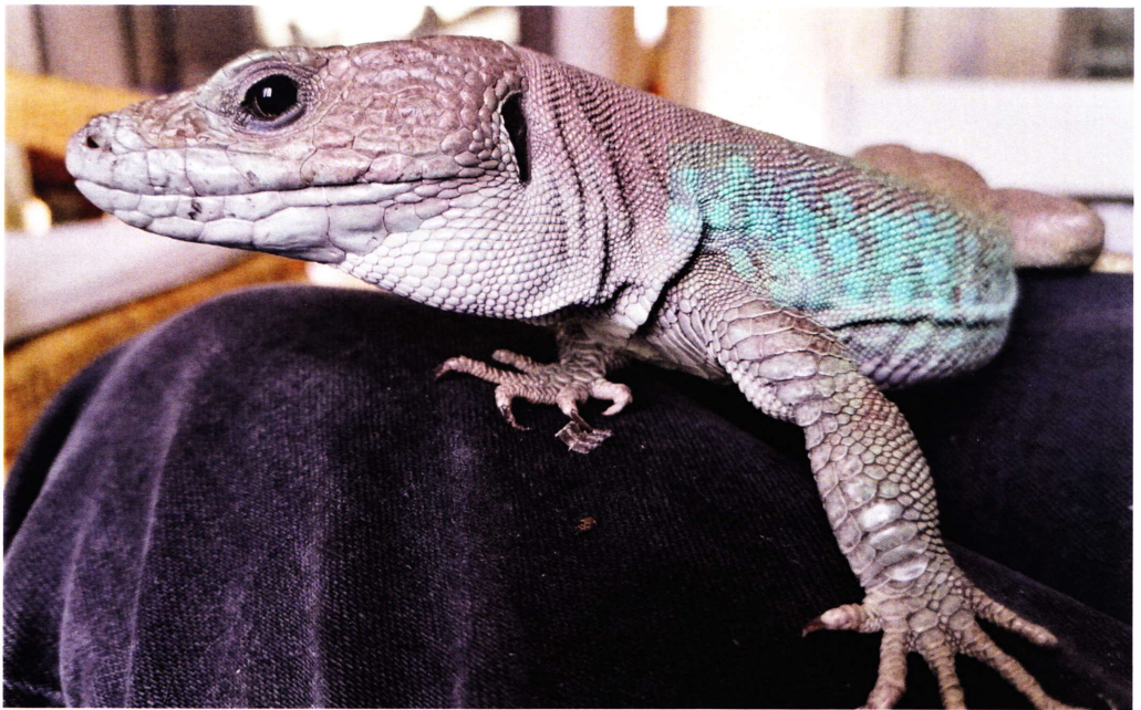
Figure 8. Captive bred adult male Timon nevadensis with diffuse cobalt blue scales reflexions.