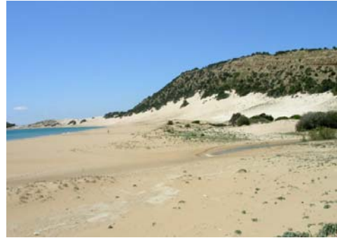
Figure 8. A general view of the Golden Beach (Karpaz peninsula) on which we observed the sea turtles and many other herptile species.

in prep.) it should be recognized as a full species as T. cyprianus .