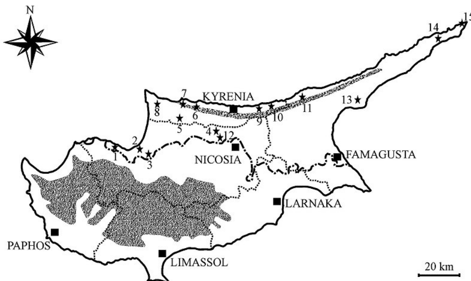
Figure 1. Map showing the localities which were surveyed during our trips in 2007 (The interpretations of used numbers are given in the text).

In 2007, We conducted three trips to Northern Cyprus during the dates between the 30 th March-8 th April, the April 22 nd -May 7 th and the September 15 th -28 th . Amongst the intensively surveyed exact localities were Yeşilirmak [1], Yeşilyurt [2], Taşpınar [3], Gönyeli [4], Kambyli [5], Kornos (Selvili Tepe)-Lapithos [6], Güzelyalı [7], Kormacit [8], Alagadı Turtle Beach [9], Esentepe [10], Taflısu [11], Asidere stream (Nicosia) [12], Çayırova (Famagusta) [13], Golden Beach (Altınkum)-Karpaz peninsula [14] and Zafer Burnu-Karpaz peninsula [15] (Fig.1, Tab.1).