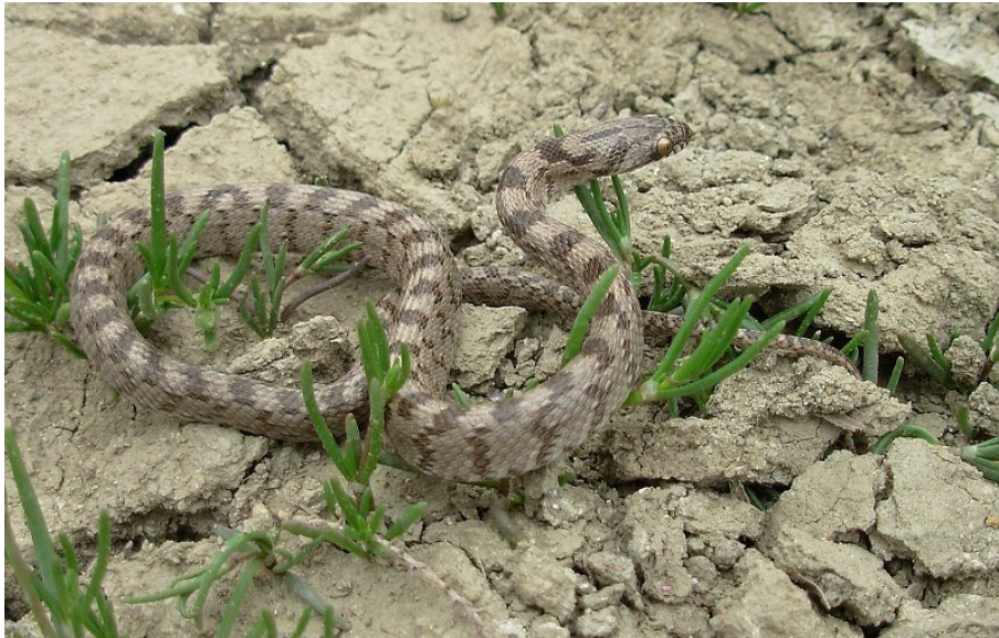
Figure 9. A juvenile T. f. cyprianus from the area between Kambyli and Asomotos villages.

An additional herpetological surveying was conducted to Kornos (Selvili Tepe, about 1200 ms asl) and its