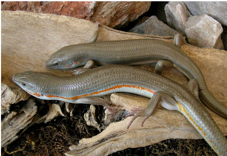
Figure 7. A male (below) and a female E. schneiderii ssp. from Gönyeli (Nicosia District, Northern Cyprus)

specimen and also, the darkened flanks, the two dorsolateral light bands and the presence of the few scattered small orange spots on the hind legs lead us to conclude that the Cypriot population is not identifiable with the known subspecies from the Levant countries. Thus, we accept that the subspecific status is E. schneiderii ssp.