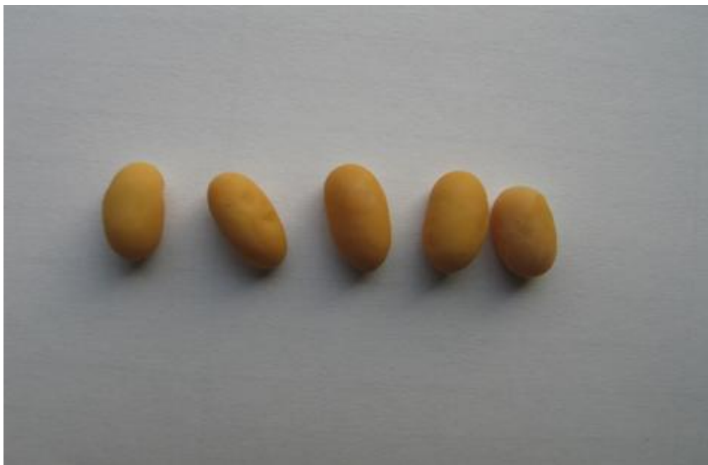
FIG. 4.- The eggs of Eremias trauchi trauchi .