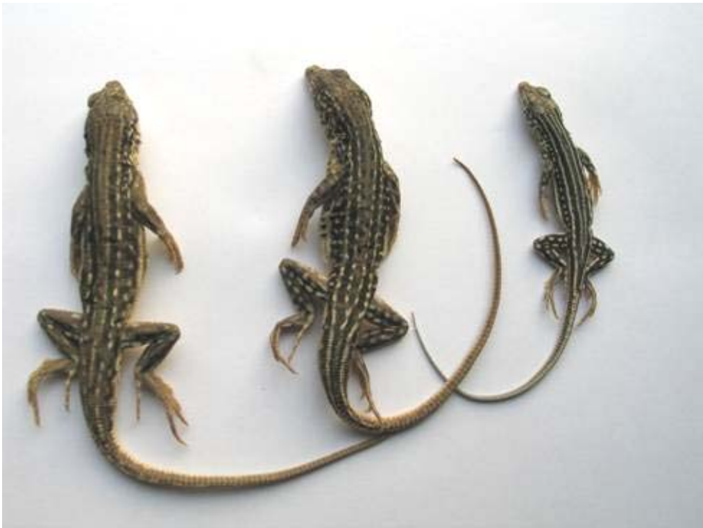
FIG.2.- Color pattern in Eremias trauchi trauchi one juvenile (right) and two adults (left)