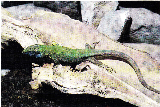
70A. Lacerta viridis

Distribution: Widespread in Middle and S Europe, also in Turkey; with a vertical distribution to 2000 m. A single subspecies in Turkey; L. v. meridionalis CYREN, 1933 in Turkish Thrace, also extends from NW Anatolia towards Espiye in the west, in the Black Sea coastal strip.