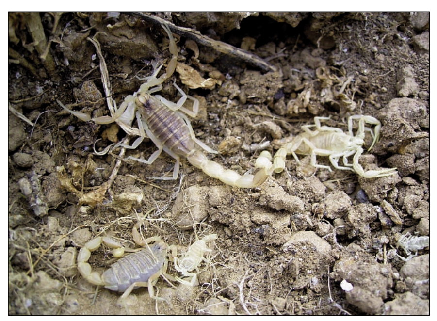
Figure 3.- The density of Buthus occitanus in the Columbretes Islands is very high.

comments, and to Eva Mestre for the photo that illustrates the figure 1a. This work was conducted on a contract "Ramón and Cajal" from the Spanish National Science Foundation (CSIC), and the Project MEC CGL2005-00391/ BOS (J. Martín & P. López, MNCN-CSIC).