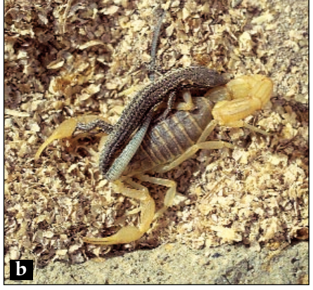
Figure 1. Scorpions (Buthus occitanus) predating on juveniles of Podarcis atrata under natural (a) and captive conditions (b).

The poison of B. occitanus was lethal to one juvenile lizard maintained under captive conditions. However, 10 adult males with a mass of 8-10 g and 9 adult females of 4-7g survived after being stung by adult scorpions. Only a single 5 g female died after the scorpion injected venom into the cervical region. The effect of the venom on the other lizards was variable. After being stung, lizards were licking the body part were the scorpion stinger had penetrated, shook their heads, appeared exhausted, and showed paralysis of the hind legs for a few minutes. However, we did not quantify the duration of these effects.