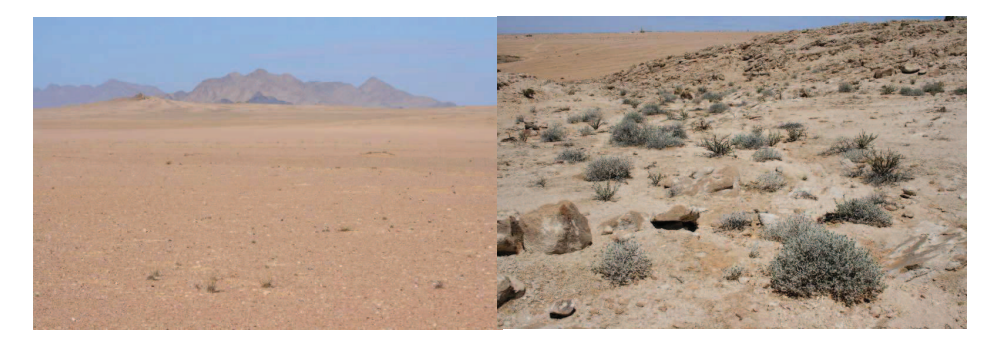
Figure 2 : Left) Sparsely vegetated grassy gravel plains typical of most of the Swakop Uranium area with the Husab Mountain in the background. Right) Vegetated marble ridges extending down towards the Khan River and occurring as an intrusion into widespread exposed broken rocky granite and metasediment terrain. Note the drilling rigs on the horizon in the background.

The habitats covering the largest part of the study area were described as part of an Environmental Impact Assessment for the mine (Wassenaar & Mannheimer 2010). Typical habitats are the Khan River, three plains habitats (gypsite plain, grassy gravel plain [Fig. 2-left] and hard undulating plain), rocky valley drainages, plains drainage channels, broken rocky pink granite, broken rocky black metamorphosed sediments, marble intrusions in broken rocky terrain (Fig. 2-right), and koppies and ridges on plains. The latter included ridges consisting of mostly marble rock with relatively high habitat diversity, as well as more simple metamorphosed sediments of the Khan group. It is especially the marble ridges that are relevant to this study, both those occurring as inselbergs on the plain, and those that occur as intrusions into broken granite and metasediment rocky terrain (Fig. 2-right).