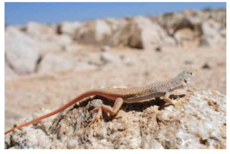
Figure 3 : Pedioplanis husabensis in typical marble boulder dominated habitat in the Husab area.

According to the Namibian Nature Conservation Ordinance of 1975, the conservation and legal status for P. husabensis is viewed as "endemic" and "secure" and proposed as "protected" under the new Parks and Wildlife Management Act (In Prep.) (Griffin 2003). Pedioplanis husabensis is furthermore viewed as "threatened" by the 'Uranium Rush' (SAIEA 2010). Its total known range at this stage is probably less than 5,000 km<sup>2</sup> (Wassenaar et al. 2010), which would put it in the "endangered" category according to the IUCN Red List Categories and Criteria (IUCN 2001).