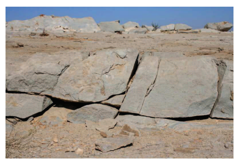
Figure 4 : Typical broken grey marble ridge with medium/large boulders with numerous cracks and crevasses used as refuge by P. husabensis in the Husab area.

more open areas with smaller boulders or plate rock while R. boultoni were mainly encountered in areas with large boulders. P. husabensis seemed to favour the intermediate areas which are vegetated with a combination of medium and large boulders with suitable refuge (Fig. 4).