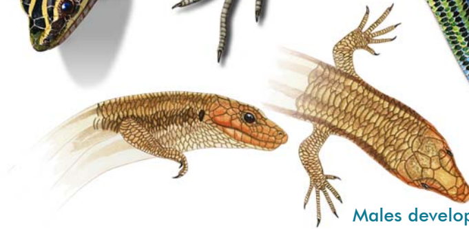
Males develop reddish jaws during mating season.

W ith smooth, shiny scales that are typical of all skinks, the five-lined skink gets its name from the five light yellow or whitish stripes that run lengthwise along its body, eventually fading on the tail. Juveniles have a uniform black body with sharply contrasting stripes and a brilliant blue tail. As the skink matures, the blue tail fades to gray. The stripes on the female's head also fade with age, but the body stripes remain distinct. Older male skinks also experience color changes, sometimes completely losing their stripes and becoming a uniform olive brown.