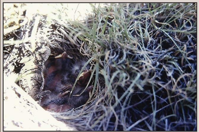
FIG. 1. Phrynosoma hernandesi (Greater Short-Horned Lizard) in the nest of a Lark Bunting ( Calamospiza melanocorys ).

The nest association we observed occurred over four days, and it was unclear if the lizard gained any thermoregulatory or dietary benefit from the association. While in our presence, neither Lark Bunting parent reacted adversely to the presence of the lizard. P. hernandesi is known to feed on a variety of ant and beetle species, ground-dwelling bees, true bugs, and other similar ground-dwelling arthropods in Weld County (D. Martin,