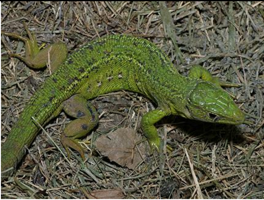
Lacerta collected by a Northern Hills biology student.