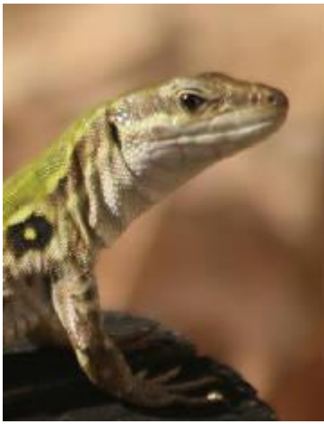
2005 RUNNING OF THE LIZARDS.