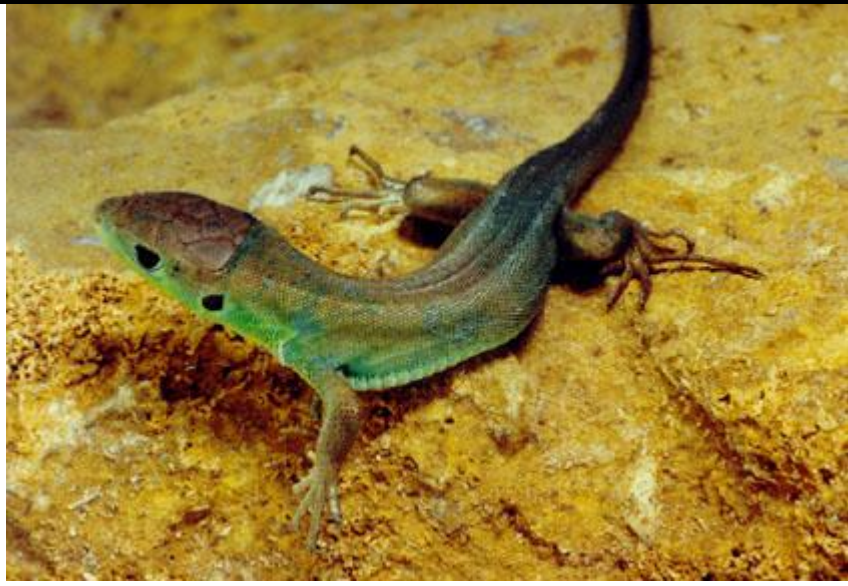
The above photo is of a young Western Green Lacerta.