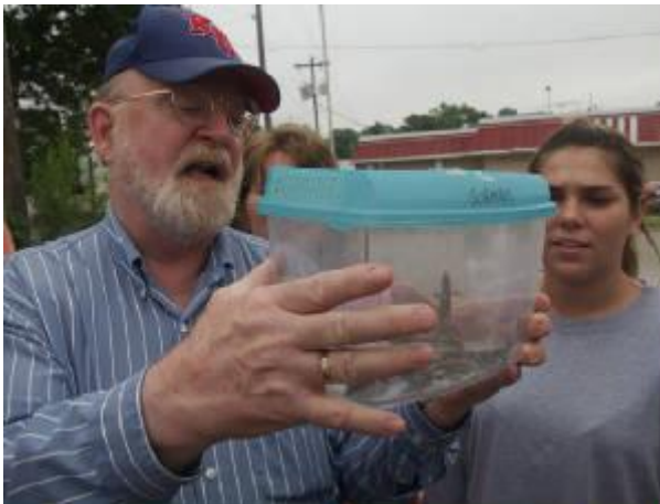
"2007 RUNNING OF THE LIZARDS"