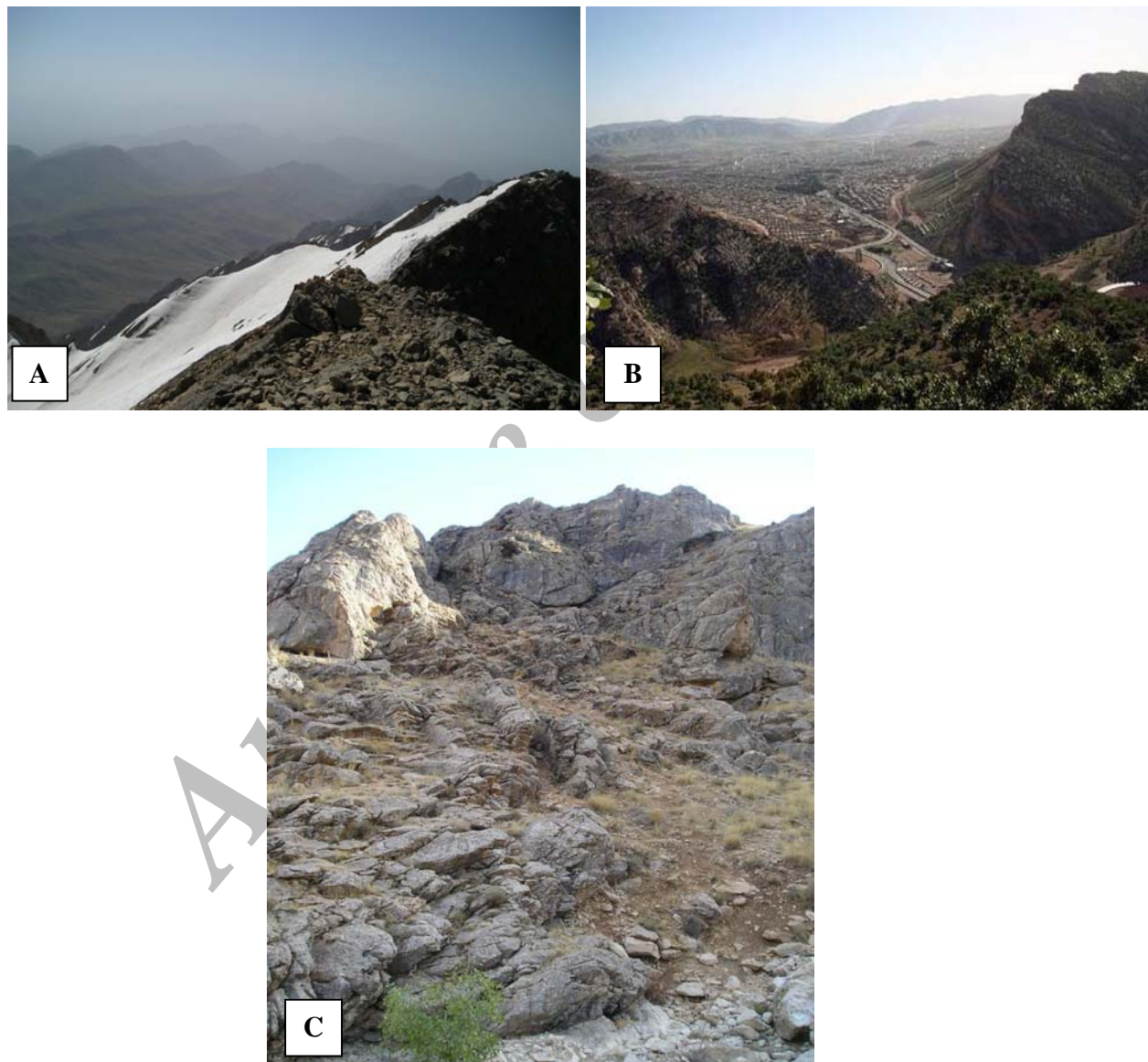
FIGURE 3. Habitats of collected specimens. A: Iranolacerta zagrosica in ery cold environment in top of Kaljonun mountain peak. B: Apathya cappadocica urmiana in oak forest habitat in Manesht va Ghalarang protected area. C: Apathya yassujica in sparsly vegetated habitat in Pire Ghar mountain side.

The Afous area is on the northern slope of the type locality with ecological factors similar to the type locality. The new specimens from Lorestan Province inhabited sharp vertical rocky slopes at 3100-3900 m altitude at Kaljonun mountain Peak, a remote and harsh habitat far from public access (Fig. 3). The specimens were observed on vertical stony slopes and in crevices. In June some adults were observed performing courtship displays. The population at the mountain peak was of high density. The specimens emerged from crevices in rocks and were easily captured. Laudakia caucasia was the only sympatric species observed in the habitat. In Kuhrang region, specimens were collected on stonewalls made by nomads on the mountainsides. Astragalus sp. was the predominant vegetation, and the area was overgrazed.